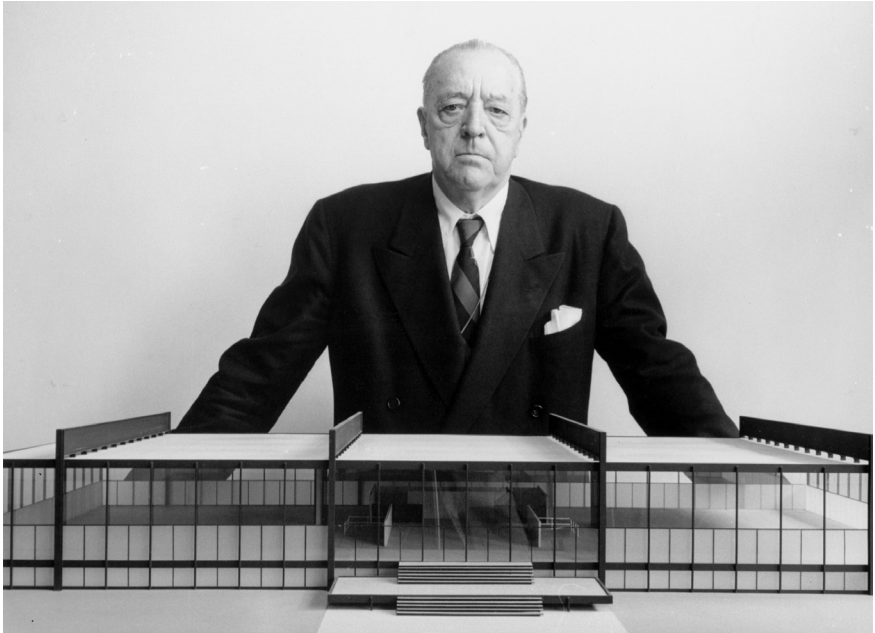
Figure 4. Mies van der Rohe with a model of Crown Hall (photographer: Arthur Siegel), courtesy Chicago History Museum #ICHi-15955.

confront a host of inconvenient questions: who else is in the room? What other models were set aside in order to highlight this one?