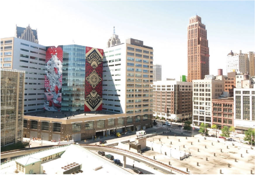
Figure 1. Murals by Shepard Fairey ( right ) and How & Nosm ( left ).