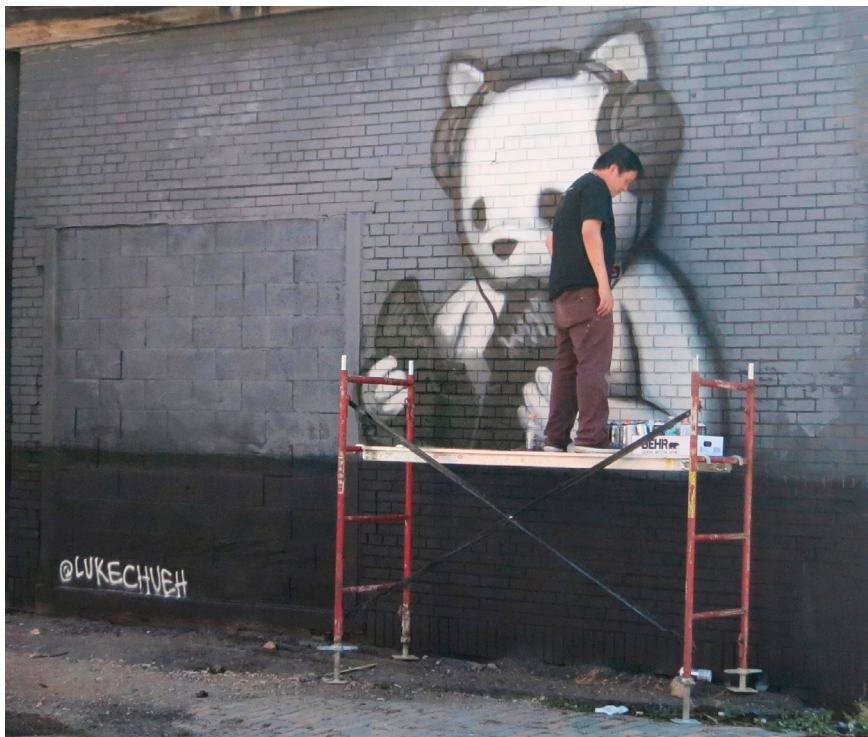
Figure 3. Luke Chueh, Mural in progress, Detroit, 2015. Note the Instagram handle in lower left corner of the mural.

street art being produced today has neither a commitment to ephemerality, nor does it use the street as a specific artistic resource.