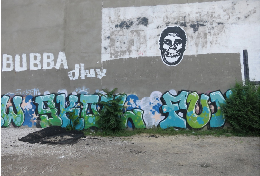
Figure 2. Unsanctioned wheat paste of "Obey Fiend Skull." Attributed to Shepard Fairey.