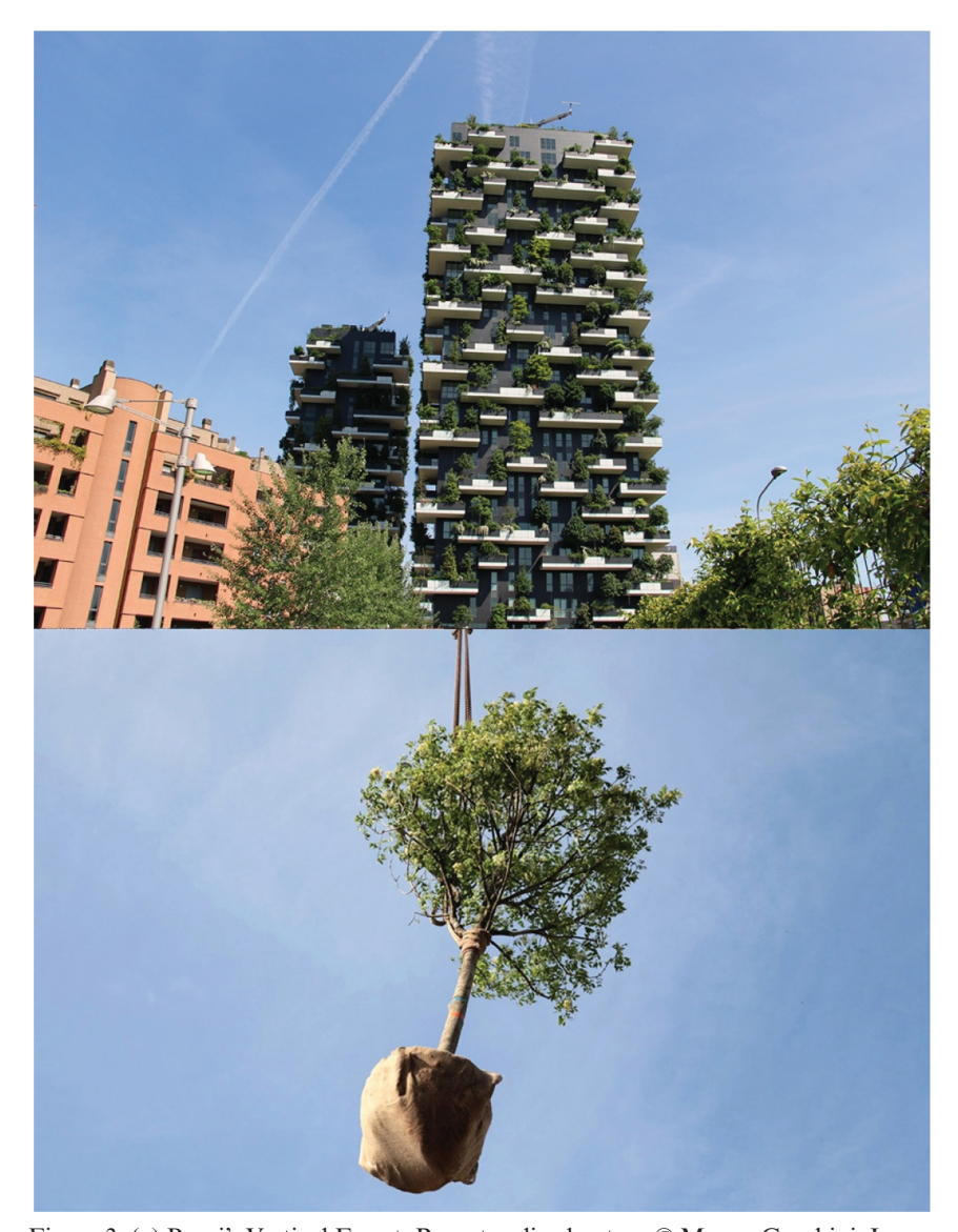
Figure 3. (a) Boeri's Vertical Forest: Re-naturalized nature © Mauro Gambini. Image use granted under creative commons - Attribution 2.0 Generic (CC BY 2.0) (b) A tree, pulled by a crane, about to be rooted in its new habitat above ground. © Fred Romero. Image use granted under creative commons - Attribution 2.0 Generic (CC BY 2.0).