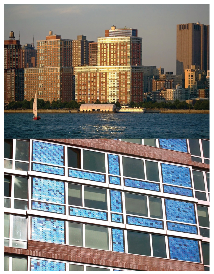
Figure 1. The Solaire by Pelli Clarke Pelli, New York (2002). A fully air-conditioned LEED Platinum rated residential high-rise. A trade-off between socio-territorial equilibrium and energetic gains © Jeff Goldberg/ESTO.

principles, McDonough states, "Respect relationships between spirit and matter. Consider all aspects of human settlement including community, dwelling, industry and trade in terms of existing and evolving connections between