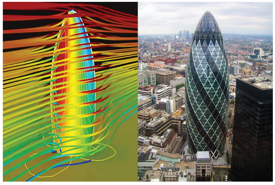
Figure 4. (a) Shaped by nature. The computational model of the Swiss Re showed that a cylindrical shape responds better to air currents than a square one and reduces whirlwinds (b)

But how can we escape this deeply rooted modern trap that compulsively projects sustainability as a self-contained and perfectly delimited eco-enclave self-legitimized by the promise of a harmonious relationship with nature? According to Timothy Morton and Bruno Latour, it is precisely sustainability's idealistic fantasy of environmental redemption that prevents us from