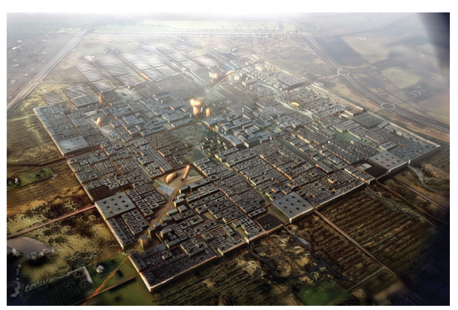
Figure 5. Rendering of Masdar. A perfectly boundaried realm of projected sustainability © Forgemind ArchiMedia. Image use granted under creative commons - Attribution 2.0 Generic (CC BY 2.0).