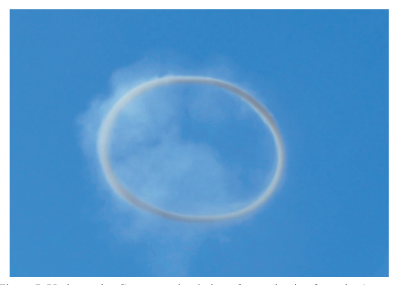
Figure 7. Up in smoke. Computer simulation of a smoke ring from the Amager Bakke Energy Plant© BIG-Bjarke Ingels Group

There is hardly a better example of biomimicry: a building designed not only to look like a mountain but also to be used as a mountain. However, the project addresses our ecological predicament by projecting a (symbolic) message into the real, as an attempt to conceal the irreducible gap separating the real from the modes of its symbolization. Its meaning is precisely to have meaning, to be an island of meaning in the flow of our less meaningful daily life. A key notion here is Zizek's concept of fetishistic disavowal: the pervasive collective attitude of passive acceptance ("I know very well but . . .") of the adverse social and ecological consequences of our civilized society that make the smooth-functioning of everyday life possible by focusing on the pleasures by it provided. 43