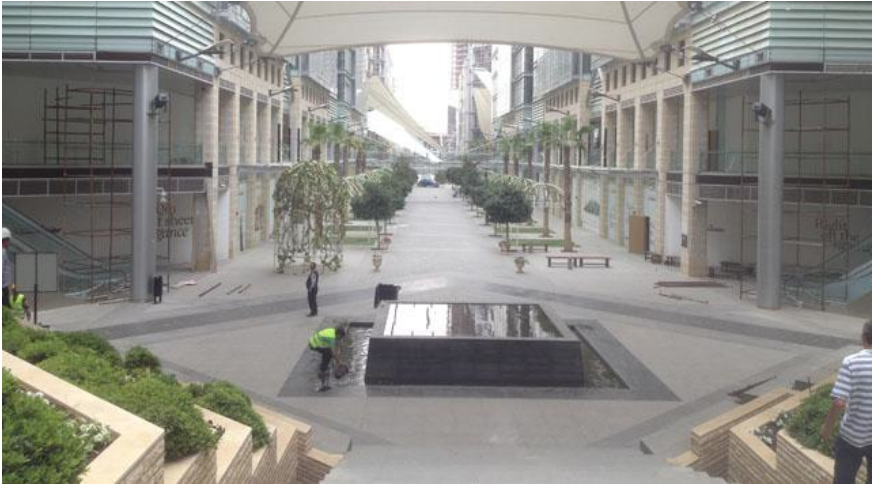
Figure 2. Daytime view of The Boulevard, Abdali, Amman, Jordan.

partners seize the business opportunities to be found in this new Amman (see Figure 2). The “public” whose interests are to be protected here would be those educated, discerning, and affluent enough to direct their discretionary money to the development’s trendy shops, dine in its rooftop restaurants, and exercise in its health clubs, and that is to say, a public quite different from the one we normally associate with Jordan. This “public” is something distinct from the local population, largely discouraged from making their presence known here. And, at the odd moments that a pre-modern Jordan makes itself felt, as it does in the Boulevard-promoted 2015 Jordanian Cultural Festival shown in Figure 3, it is contrived as “local color” almost anthropologically constructed, its obvious Orientalism at odds with the place’s bland urbanity.