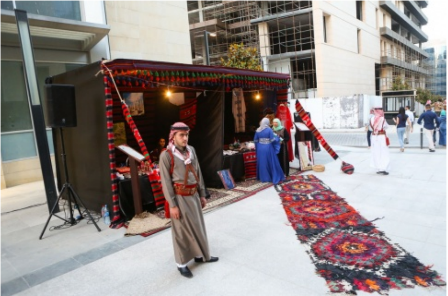
Figure 3. Artisanal installation at the 2015 Jordanian Cultural Festival on The Boulevard, Abdali. http://www.abdali.jo/index.php?r=media

More importantly, it has shown itself decidedly short on foot traffic – people, that is – probably because Boulevard’s rental space has failed to attract tenants in the critical numbers that it had hoped. When Bahaa Hariri opened the doors to the complex’s promenade, Boulevard’s ground-level shops were only 30% occupied (see Figure 4). 22