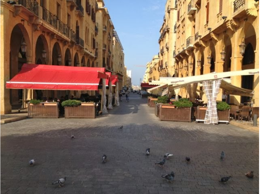
Figure 1. Maarad Street, Place de l'Etoile, Beirut.

the fabled St. Georges Hotel, whose owners have excerpted it on their banner page to draw public attention to Solidere's strong-arm business tactics and its dubious designs on their property. 3 Given the article's wide currency, it would seem that "A Matter of Life and Debt" has acquired a life of its own, having insinuated itself into modern Beirut's required reading, especially for those interested in the causes and effects of its complex urban phenomenology. Furthermore, it has been especially gratifying to observe that the questions raised there a decade ago are now being asked of kindred urban developments in the region – Amman, Abu Dhabi, Cairo, Jeddah, and Dubai included.