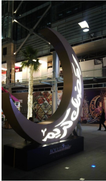
Figure 4. Abdali's Boulevard with empty shops disguised by billboards and street art at Ramadan, June 2015.

come as no surprise that SI would figure significantly in two of the huge real estate investments Hermes has helped to bankroll near Cairo, under construction since the 1990s. Eventually, New Cairo on the Suez Road to the east, and Sixth of October/Sheikh-Zayed on the Alexandria Road to the west will house, by one accounting, five million people. 26 Since groundbreaking, these suburbs have been envisioned as premium and exclusive residential locations, targeting the city's administrative class and its moneyed professional and entrepreneurial elite. 27 With the arrival of SI to the new suburbs came the "Solidere brand" and intangible value added to the property mix via two lifestyle offerings – Cairo Eastown and Westown. The builders – real estate development company SODIC – feel that the label brings to these particular projects distinctive architectural cachet, and they say so in their marketing materials. Further value is added, per the PR, by the design contributions of an international bevy of star architects who enhance Solidere's own design efforts. 28