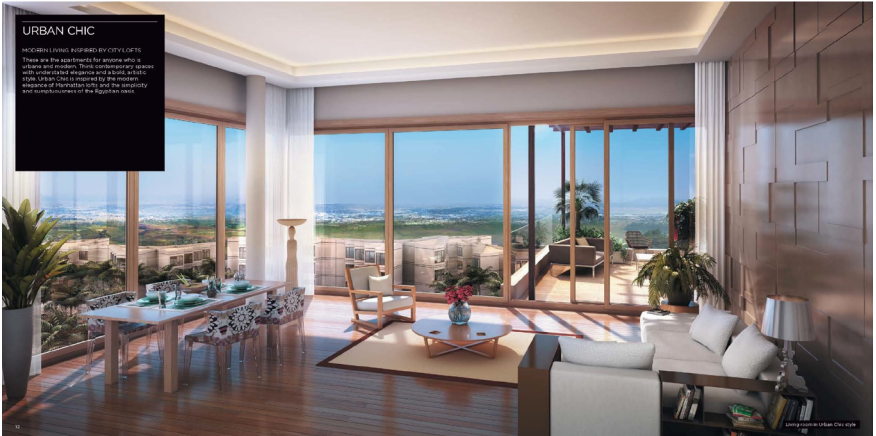
Figure 6. Forty West’s “Urban Chic.” “Urban Chic”.