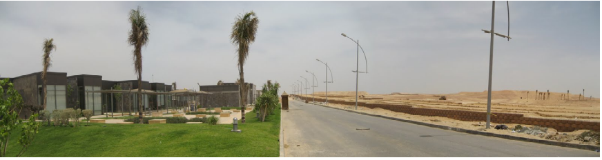
Figure 7. Allegria development, Sixth of October, showing desert proximity.

the nation’s earliest new towns. In the 1990s, however, one particularly intrepid developer made the decision to rethink this strategy as he introduced into New Cairo a luxury housing neighborhood named Ketameyah Heights, outfitted with a golf course surrounded by huge detached villas embellished with US-style lawns, barbeque grills, and swimming pools. 35 Its success was sensational. The profit margins at this enterprise were enormous, especially given the almost non-existent cost of the land, so much so it caused most others to rethink their market strategies there.