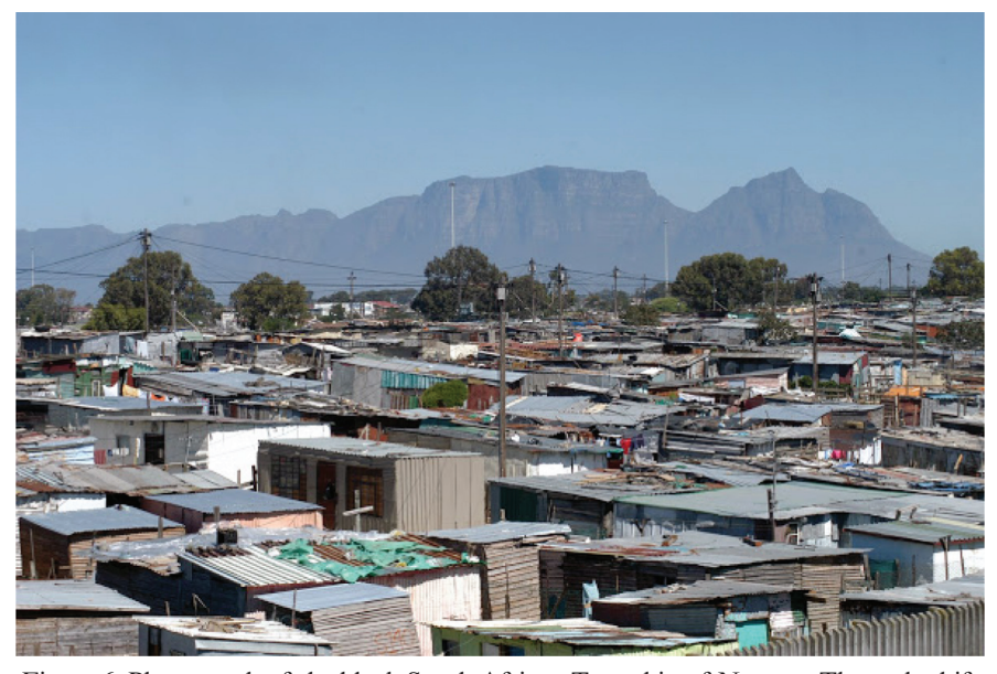
Figure 6: Photograph of the black South African Township of Nyanga. The makeshift housing is indicative of socio-economic and spatial disenfranchisement and isolation of apartheid. The polarized architectural condition of such townships, in contrast with the more affluent urban white spaces in Cape Town, served to further reinforce the association of specific residential forms with racial groups.

and culminated in the 1948 enactment of apartheid under white Afrikaner rule. Interestingly, apartheid began in South Africa as the Jim Crow era in the United States was nearing its last decade of existence. Apartheid, which lasted for nearly half a century until 1994, operated along strikingly similar lines as Jim Crow. The recurring actuality is, as poignantly illustrated by environmental historian Sylvia Washington, 113 that spatial injustices occur after the psychosocial construction of a particular group as inferior. This step is necessary to justify the segregating and discriminating spatial practices imposed upon such "othered" groups. During apartheid, only whites were allowed to live in the central areas of South African cities like Johannesburg and Cape Town. Individuals categorized as black or colored were spatially relegated to the fringes of urban life, forced to occupy suburban shanty towns and rural reservations<sup>114,115</sup> (Figure 6). Rooted in the ideals of white supremacy and colonialism, South African architecture and planning practice and expression during the era of apartheid clearly echoed the racial hegemony embedded within its social, cultural and political context. 116 As in the case of Jim Crow and gentrification, social relationships and transactions in these architectural spaces served to reinforce the racial