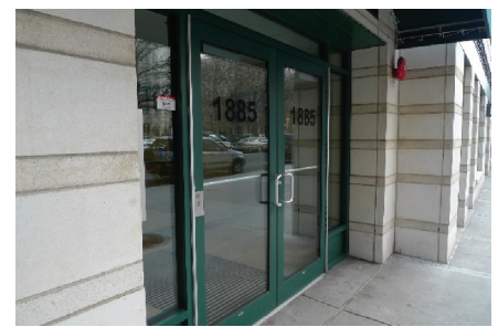
Figure 1: The six architectural photographs used in my East Harlem architecture survey-based research. The first column depicts (from top to bottom) a pre-gentrification streetscape, façade and doorway. The second column of images depicts (from top to bottom) a post-gentrification streetscape, façade and doorway.

(primarily or only occupied by whites). All images depicting post-gentrification (newer) architectural spaces received positive evaluation scores, while the images of pre-gentrification architectures were scored negatively. The results of this study indicated that different types of architectural spaces do embody differentiated social and racial perceptions as well as varied meanings via the interpretation of their aesthetic features. While the study was not designed to indicate what specific elements in the architectural photographs participants