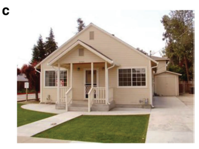
Figure 2: Images of the black (a) and white (b) families and the house (c) used in Bonam, Bergseiker and Eberhard's 2016 study. Source : Courtney M. Bonam, Hilary B. Bergseiker and Jennifer Eberhardt, "Polluting Black Space," Journal of Experimental Psychology 145, no. 11 (2016): Appendix.

shopping centers. The results here statistically confirmed that study participants showed "direct evidence of space-focused stereotype": "[Participants] imagined the neighborhood to have less positive characteristics when the home's sellers were Black, rather than White . . . felt less connection with the neighborhood when the family was Black as opposed to white . . . [and] provided a less positive house evaluation when the family was Black rather than White." (p. 1568)