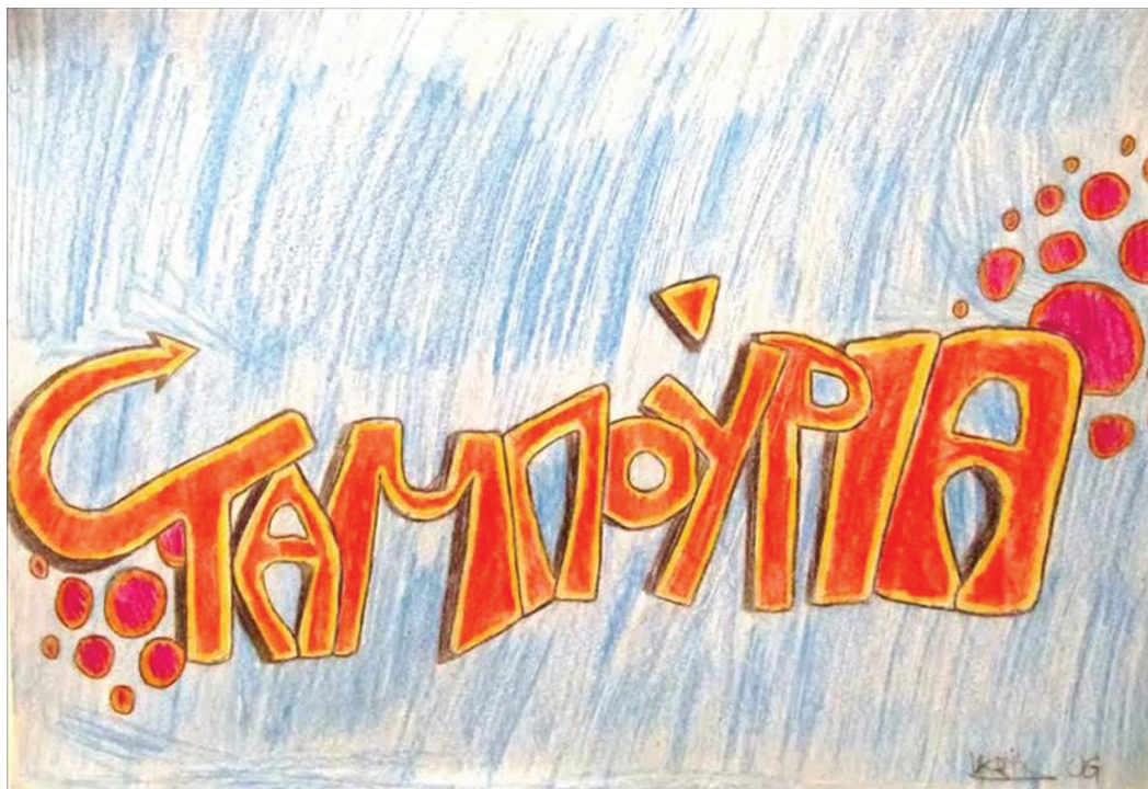
Figure 2: Screengrab from the documentary showing the last graffiti shot

a series of images in their minds formed by the reading of history books, exposure to archive material in school settings, documentaries, family narrations (with and without the use of visual material such as photographs) and a broader cultural memory of past experiences inherited from the communities of which the students were a part.