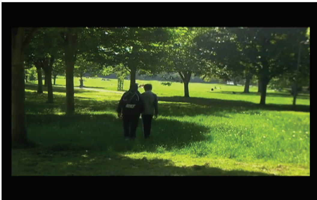
Figure 3: Beautiful images of a bleak future in Not Going Anywhere

While I do not regret these small, complementary tweaks, I do regret on impulse changing the name of the film without the children's approval from Off Track to Not Going Anywhere . Rewatching the film late in the process of reconstructing Arooba's edit, I noticed that the line 'He's not going anywhere' emerged powerfully from the first scene, in a manner that seemed to exert a greater resonance over the rest of the film than Off Track . In retrospect, I feel my intervention here went beyond appropriate co-creation, representing an authoritative, non-collaborative imposition on the film. I now wish I had factored in a greater degree of time in order to run the decision by Arooba, Josh, Ryan and their group.