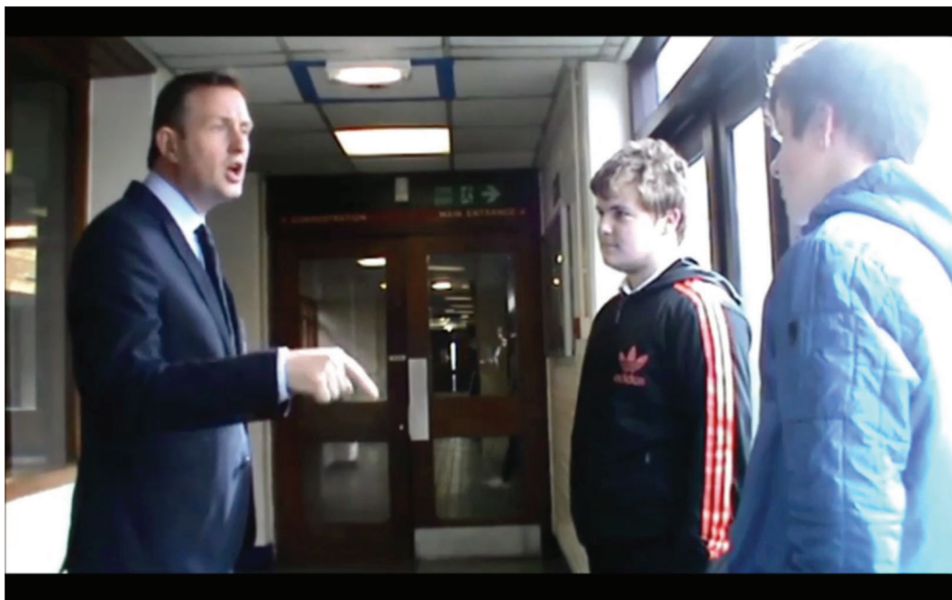
Figure 2: A hard lesson in Yes Sir