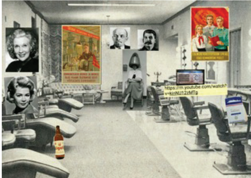
Figure 4: Student collage

Most teams successfully fulfilled the task, except for one group that evidently did not understand the assignment and presented a description of a room in written form. All other students made use of digital archives and tried to find relevant images. The collages (see Figure 4 for an example) mostly consisted of historical pictures, while only a few contemporary photographs were used to point towards less specific elements of the story (for instance, a flock of birds in the sky).