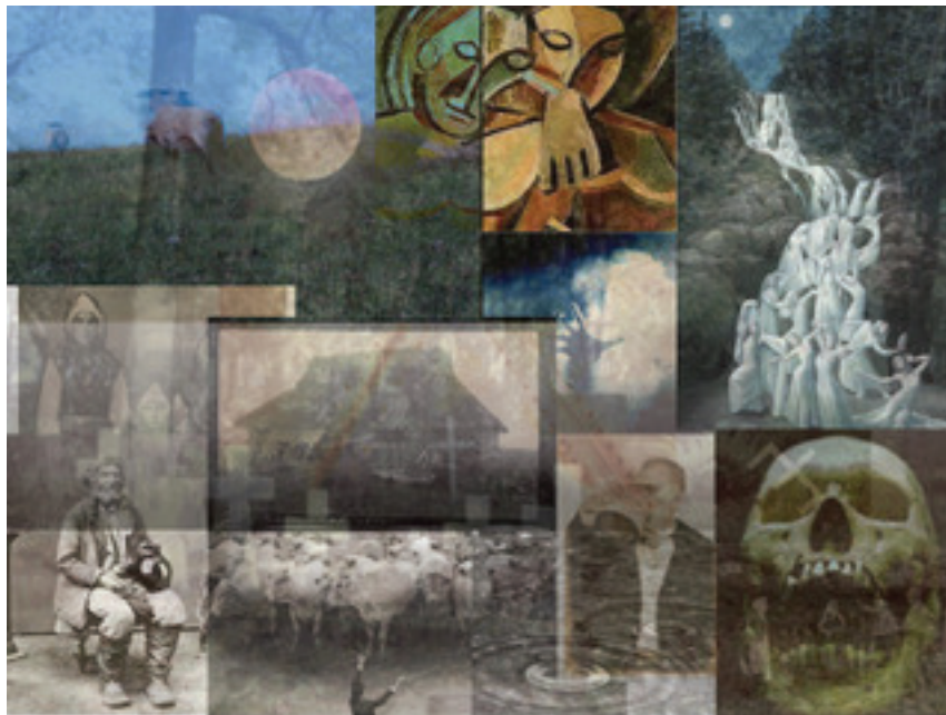
Figure 1: A mood board created by a student

The outcomes of the testing were varied (see Figure 1 for an example). The mood boards created by the students featured styles from new gothic to childishly comical, from archival to what seemed purely random. Most students succeeded in finding appropriate images and even tried to adhere to the historical time and space of the novel. To make their mood boards more integrated, students chose a dominant colour theme (usually black-and-white, grey and dark brown), used images of a similar style, and sometimes even used visual editing tools to blend the images together. Several mood boards included intertextual references to other works of art, such as historical photographs, paintings and films. At the same time, hardly any student attempted to translate the comical literary style of Kivirähk : they focused on what was mediated, but not on how it was done. Thus, one of the key conclusions we drew from these observations is the necessity of developing the ability to differentiate between content and form.