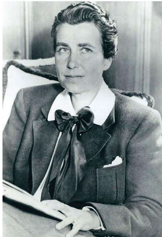
Figure 1. Dorothy Arzner (1897–1979) was a top Hollywood director during the 1930s

A major change in the process by which US-based film-makers 'learnt the ropes' of the business was under way in the 1950s. Prior to these years, film practitioners acquired their training while apprenticing at the studios, as Arzner had done following the First World War. By the 1950s, however, would-be film-makers were learning their craft by taking hands-on production courses at colleges and universities. Arzner was at the centre of this paradigm shift, serving as a critical bridge between the older generations of film practitioners who received on-the-job training and the first wave of college-educated film-makers. Among her students were: Francis Ford Coppola, who became a multi-award-winning screenwriter and director, renowned for the Godfather trilogy and many other films; Daisy Gerber, the only woman enrolled in UCLA's directing programme at the time, and who later served as an assistant director on more than three dozen films and television episodes; and Donald Shebib, who made documentaries for the National Film Board of Canada in the 1960s, and who went on to become one of Canada's most significant independent film-makers.