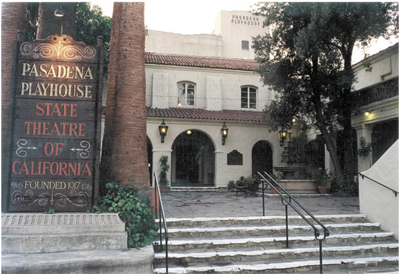
Figure 2. The Pasadena Playhouse College of Theatre Arts, the venue for Arzner's first collegiate-level film-making courses

(Pasadena, c.1955). The former is an omnibus film featuring adaptations of three O. Henry short stories – ‘Jeff Peters as a personal magnet’, ‘One thousand dollars’ and ‘Psyche and the skyscraper’ – while the latter is a dialogue-heavy crime drama photographed in a shadowy film noir style.