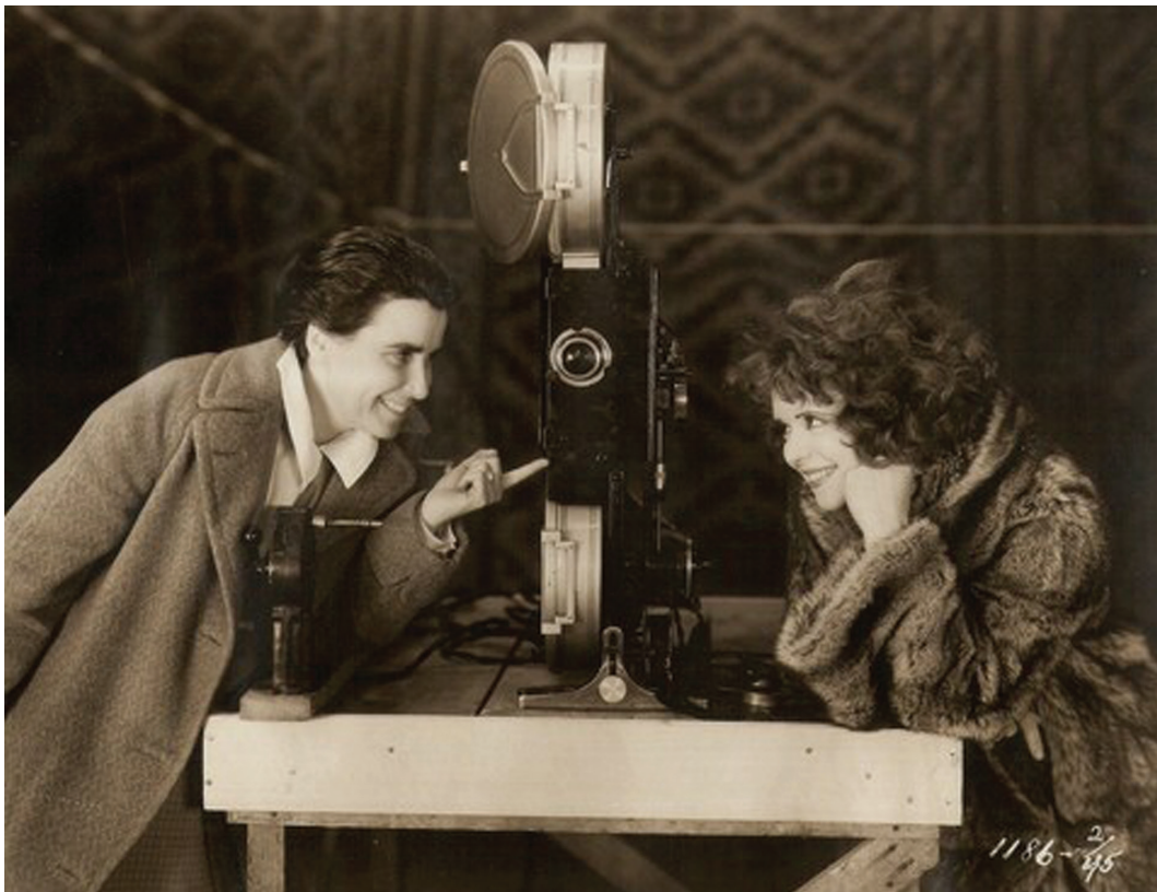
Figure 3. Arzner (left) shares a light moment with Clara Bow on the set of The Wild Party in 1929. With its college setting, The Wild Party was a favourite among Arzner's UCLA students

gathered as many of my pictures that they could and ran one every week on Friday afternoon for a festival. The place was jammed with the kids to see what I had, and it was fun for me to see them and hear their comments in the evening. I found they were very interested in these pictures that were made so far back. (Quoted in Brownlow, 1970)