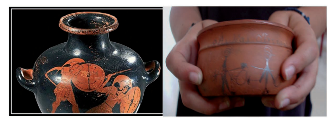
Figure 3: Reading myths represented on pottery