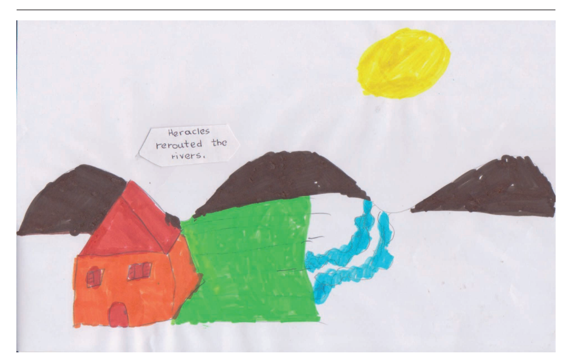
Figure 4: Child's drawing - Hercules rerouted the rivers Alpheus and Peneus to wash out Augeas's stables

Similarly, when Ulysses descends to Hades, the Underworld is connected to certain representations and becomes the pretext for the promotion of religious traditions and views about life and death. More specifically, a pupil mentions that 'There is darkness everywhere and silence, and the dead are resting'. There were also pupils who noted that: 'The Underworld is deep below the earth and only bad people go there' and also 'it is a place for lost souls'. Moreover, some pupils said that 'People die and are born on earth', implying that there is a continuous life cycle.