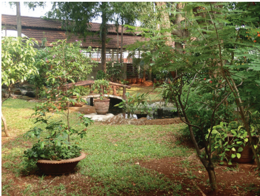
Figure 2: The indigenous garden

Exploring the school grounds. There was no one around, classes were on. Beautiful – so green, so shaded and still – in the tropical heat – a rainforest garden – an enclave within a depleted local environment. Birds singing, insects humming. The modern school buildings with sloping and overhanging rooves, and outdoor covered spaces: colonial architecture alongside vernacular Rumah Adat styles. The grounds are abundant with trees and indigenous plants, streams and bridges (see Figure 2). There are other cultural features. Stone circles form meeting places. International flags fly from the main building. Student art decorates the garden: hand painted maps on a wall; an Indonesian village model; colourful masks and other artefacts are hanging from the trees (see Figure 3). Signs warn of electric storms, and what to do in the event. A number of gardeners, local staff, are hunched over their work in their green and earth-coloured uniforms, screened from the sun by wide-brimmed hats, working quietly and methodically. A bell went off and suddenly the grounds were full of children moving along the walkways between buildings to their next lesson, then quiet again.