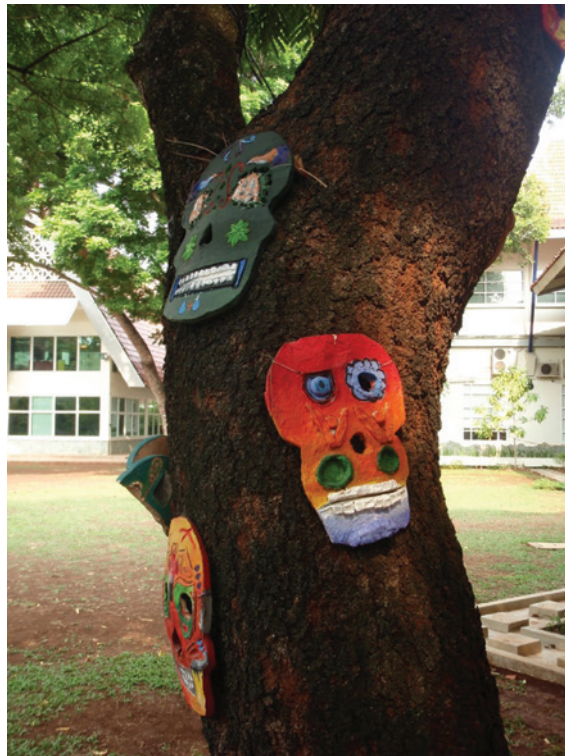
Figure 3: Student art: indigenous masks

In posthumanist thinking, the agency to act is shared across the socio-material world: humans, nonhumans, plants, objects and things have agentic capacities. Bennett (2010: 32) refutes the idea of human intentionality as the only force able to bring about change and, instead, proposes the idea of distributed agency to represent 'a swarm of vitalities at play'. Distributed agency acknowledges that nonhuman forces, forms and matter (such as the sun, storms, water, gravity, electromagnetism) act together in distributed agency. Barad (2007: 33) challenges the minority world, humanist view that there are separate individual agencies that precede their interaction and argues for the need to replace this with the notion of 'intra-action' which 'recognizes that distinct agencies do not precede, but rather emerge through, their intra-action'.