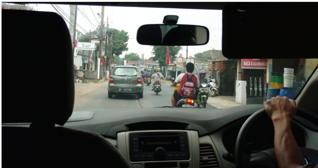
Figure 1: Driving on the side roads to the school

We crawl along a highway congested with rush hour traffic: expensive cars, scooters, lorries, vans, carts. People fill the roads. The highway is lined with glittering skyscrapers and tall palm trees. Billboards advertise new housing complexes, college courses and shopping malls. Behind and between there are informal dwellings, derelict spaces and smoking rubbish piles. Clothes hang on washing lines, belongings spill outside: chairs, tables, boxes, clothes, cupboards. A woman is pushing her food cart the wrong way up the busy slip road onto the highway. In the distance – a haze. The driver says the rainforest is burning. The heat, smell and noise are palpable inside the air-conditioned car (see Figure 1).