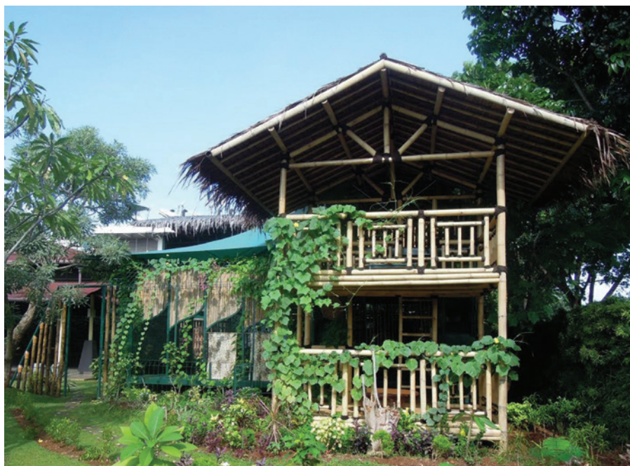
Figure 4: Sekolah Aman

We arrived, a mini green oasis. A line of small children greet us Indonesian style, huge smiles on their faces, and dressed in colourful batik shirts. It is an open-air school, set in the grounds of a multinational company which provides sponsorship. Built in steel and bamboo with a thatch roof, classrooms are divided by plants, bamboo and bookshelves (see Figure 4). Vegetation and building intertwine; vines creep up the chalkboard and down the bamboo divides; the external bamboo screens are alive with orchids, creepers and ferns.