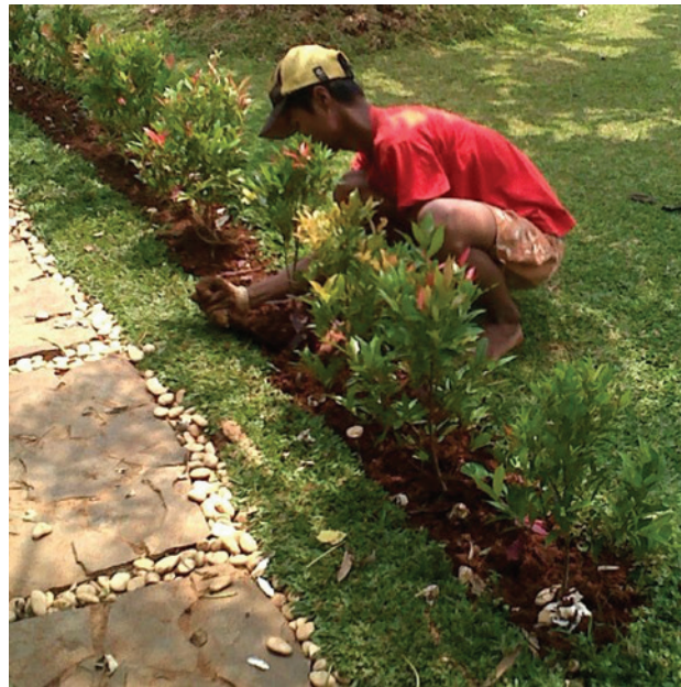
Figure 5: Sekolah Aman's gardener at work

The children have spent their previous short lives begging or scavenging on the rubbish tips, toxic from the burning plastic. I met the gardener (see Figure 5), two teachers and a cook/helper, all from the local community; the gardener was also previously scavenging. Every day the school provides a meal of fresh local food, cooked in situ for the children and staff. The teacher is a former pupil of Sekolah Aman. Following a scholarship into secondary education he is now studying accountancy at night school and works here every day.