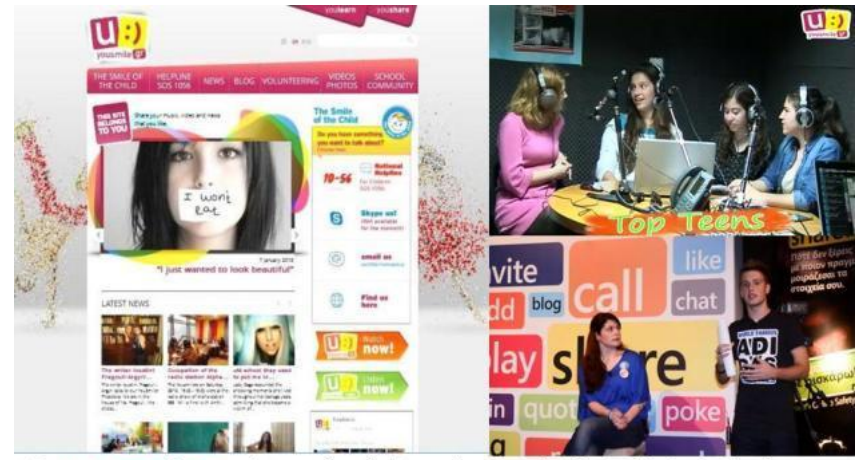
13. <u>www.yousmile.gr</u>, an interactive platform of communication and information between teenagers