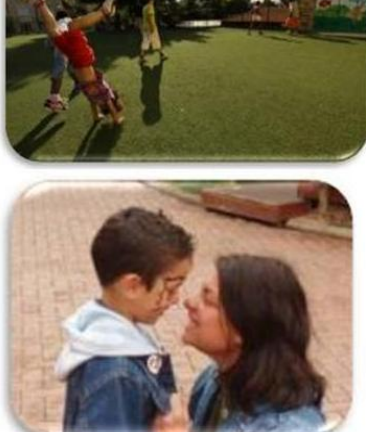
5. Our Homes

emotional, psychological, social, medical and educational support.