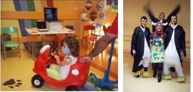
11. Our team provides a variety of activities to help children cope with any pain, anxiety or fear they might experience during their time in hospital.