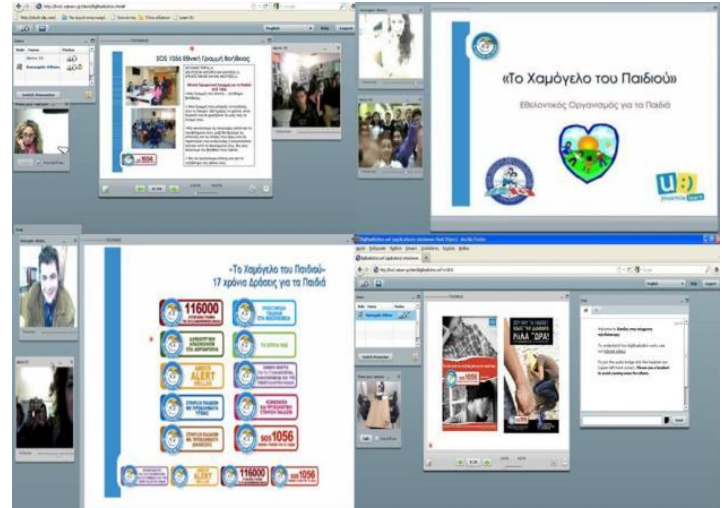
14. E-learning sessions

Last but not least, 'You Smile' addresses one very important right of every child, to freely express themselves as is so clearly stated in the CRC<sup>5</sup>.