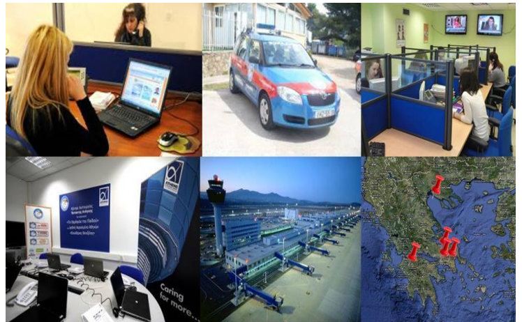
4. Pan-Hellenic Center of Immediate Social Intervention

When a child is in immediate danger, our primary goal is to transport the child safely to a protected environment, and subsequently find the best solution possible