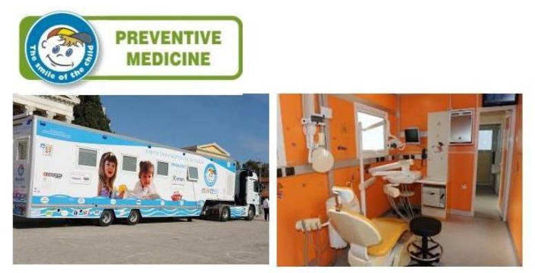
10. Medical and social support is provided on a 24hour basis free of charge

cardiology, ophthalmology, dentistry and will soon have an independent power source. At the same time, it is important to mention that through telemedicine there will be connection with doctors provided.