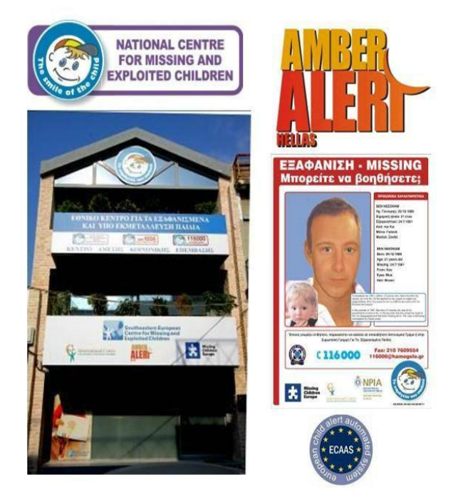
2. National Centre for Missing and Exploited Children

The National Centre is staffed primarily by social workers and psychologists, and works very closely with the Greek National Police, the Public Prosecutor for Minors and the mass media. In fact, once the Greek Police determine that there are reasonable grounds to believe that a missing child is in immediate danger and they issue an alert, it is the Centre that is responsible for the activation of