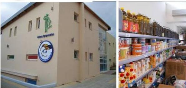
8. Welfare support to families and children in need

Family is the most important building block of society. Any issue may affect functionality and relations between its members. Critical or traumatic situations, such as unemployment or divorce, can lead to family breakdown and the manifestation of severe difficulties.