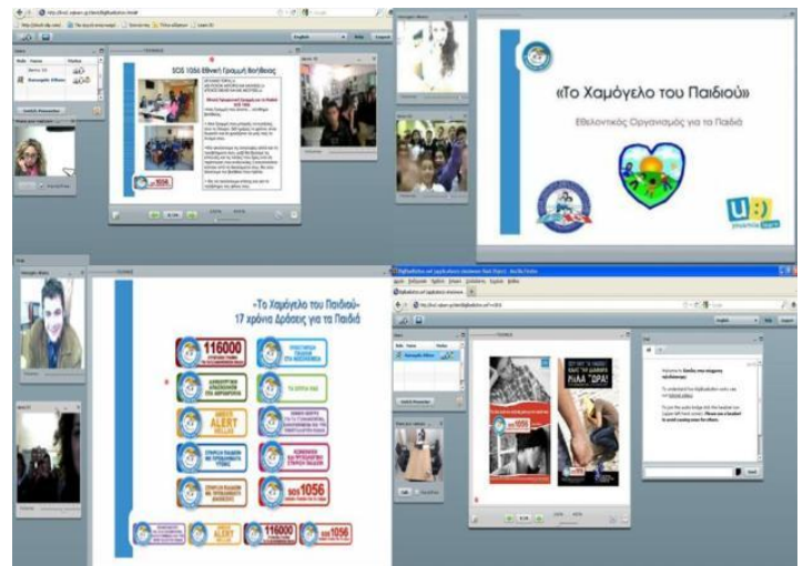
14. E-learning sessions

Last but not least, 'You Smile' addresses one very important right of every child, to freely express themselves as is so clearly stated in the CRC 5 .