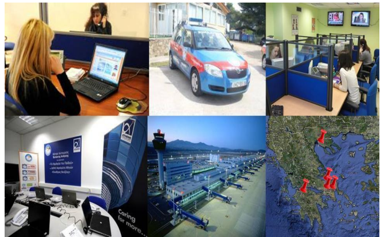
4. Pan-Hellenic Center of Immediate Social Intervention

When a child is in immediate danger, our primary goal is to transport the child safely to a protected environment, and subsequently find the best solution possible for the child, in cooperation with all the relevant bodies. Our organization is usually informed about children in danger through phone calls from socially aware children themselves.