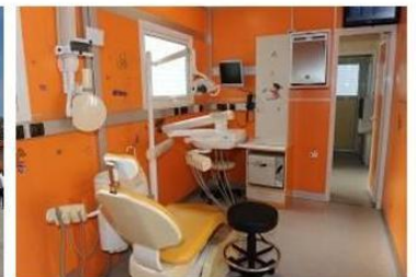
10. Medical and social support is provided on a 24hour basis free of charge

These activities are implemented under the auspices of the competent Greek Ministries: Education, Life Long Learning & Religion, and Health & Social Solidarity.