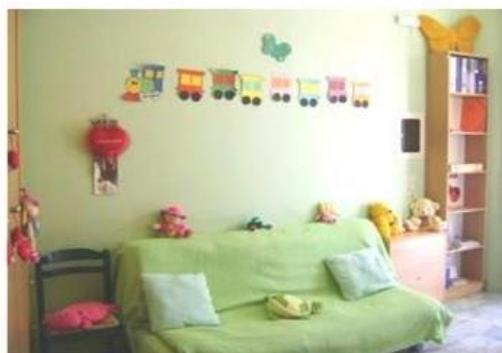
6. Our Daily Care Centres