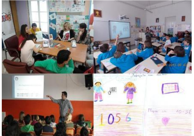
12. Interactive sessions

The sessions are provided in cooperation with the Greek Ministry of Education, following an invitation either by the school advisor, the health education supervisor, the headmaster, the Teacher Association, or the Parents and Legal Guardian Association. The subjects of the sessions include The Smile of the Child and its actions, domestic violence/abuse, school violence/bullying, internet abuse and good and bad uses of technology. This service addresses at least two of the Articles of CRC 4 .