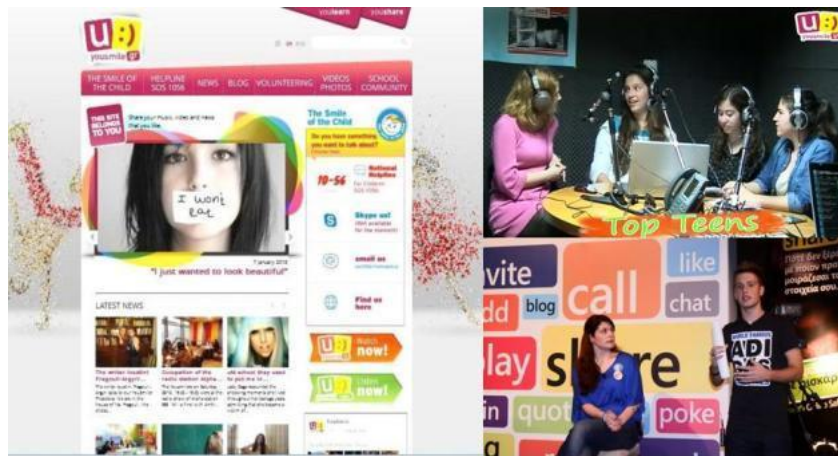
13. www.yousmile.gr , an interactive platform of communication and information between teenagers

You Smile: An innovative platform of communication between teens, as well as the entire school community