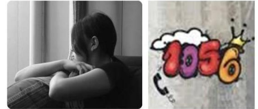
7. Social & Psychological support