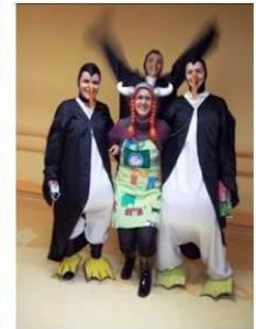
11. Our team provides a variety of activities to help children cope with any pain, anxiety or fear they might experience during their time in hospital.

All three of the aforementioned services, that is Providing medical aid & support to children facing serious medical and health conditions , Preventive medical and dental programmes with the Organization's medical vehicles and equipment in schools throughout Greece and Creative Occupation in Children's Hospitals , address specific articles of the CRC 3 regarding the concept of health as far as children are concerned.