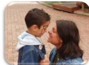
5. Our Homes

According to this model, children attend everyday school classes in the neighbourhood school, participate in after-school activities and engage with people of their own age, whilst professional experts stand by their side and support them in every aspect of their life, from babyhood to the end of their studies or to starting their own family. Thus, we continue to support and care for our children until they become independent, productive members of our community.