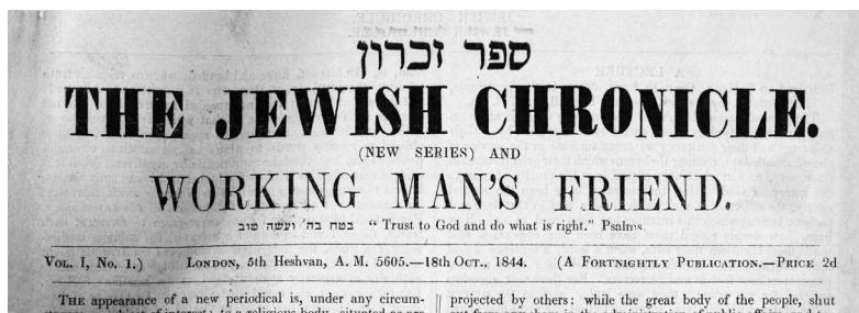
3 Masthead of the first number of Mitchell's Jewish Chronicle and Working Man's Friend, 18 October 1844.