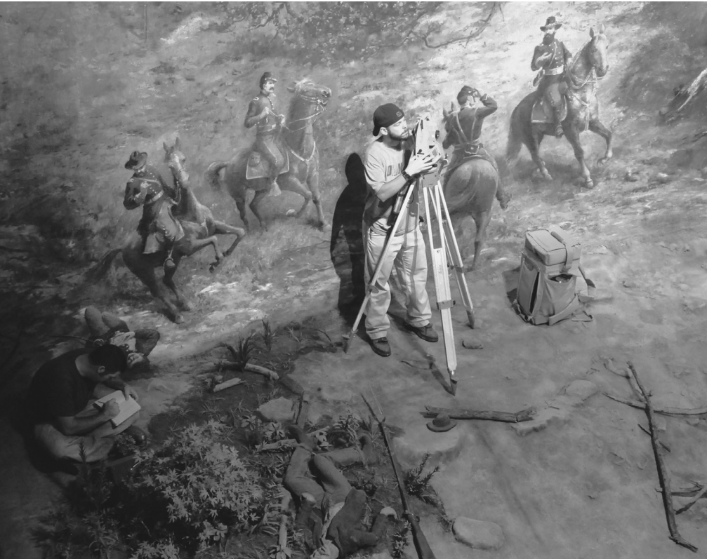
2 Surveying the Battle of Atlanta cyclorama, 1886, with three-dimensional figures added 1934–36, after its move to the custom-built Lloyd and Mary Ann Whitaker Cyclorama Building, Atlanta History Center, to be reopened in autumn 2018.

narrative about the fierce fighting as Confederate defenders of Atlanta unsuccessfully counter-attacked the Union army on 22 July 1864. I learned early on that the symbol for Atlanta was the phoenix, the mythical bird that, like our city, rose from the ashes after Sherman's attack.