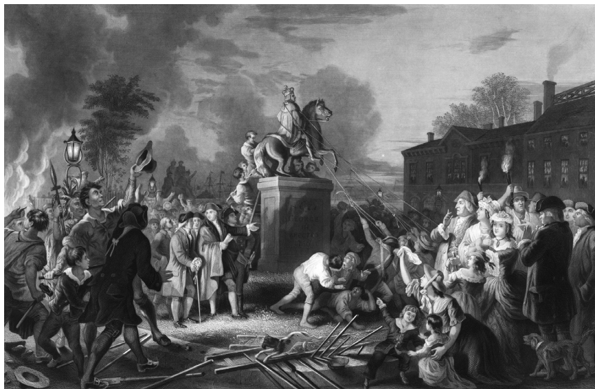
5 John C. McRae, engraving after Johannes Adam Simon Oertel's 1859 painting, Sons of Liberty pulling down the statue of George III of the United Kingdom on Bowling Green, in New York City in 1776 . New York: Joseph Laing, c. 1875. LC-DIG-pga-02158

the South lack either the rarity or the aesthetic distinction of the colossal fourth and fifth-century Buddhas at Bamiyan in Afghanistan, which were blasted out of existence by the Taliban in 2001. Instead, these contested Confederate equestrian figures and standing male soldiers are more like the state-sponsored statues of Stalin removed in Russia after the end of Communism. Rather than important works by individual artists, these Confederate statues were casts, mass-produced in the North and given only minor touches to distinguish them from statues of Union generals.