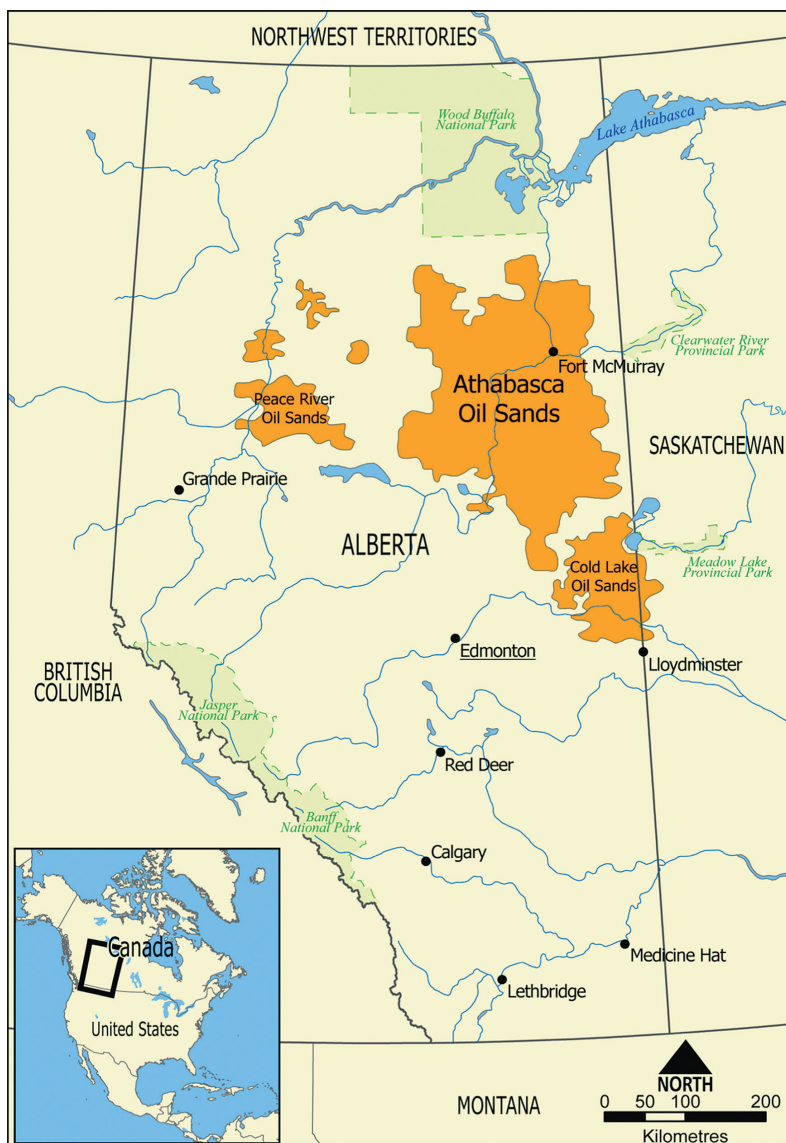
Figure 3. Map of oil sands in Alberta. Map: © Norman Einstein

Through these confidential agreements Mikisew Cree leaders accommodated their people and their future to the developing pattern of industrial expansion in their territories. They did not object to the lion's share of the 'filth' – oil sands development according to Archbishop Desmond Tutu – despoiling north-eastern Alberta. By the