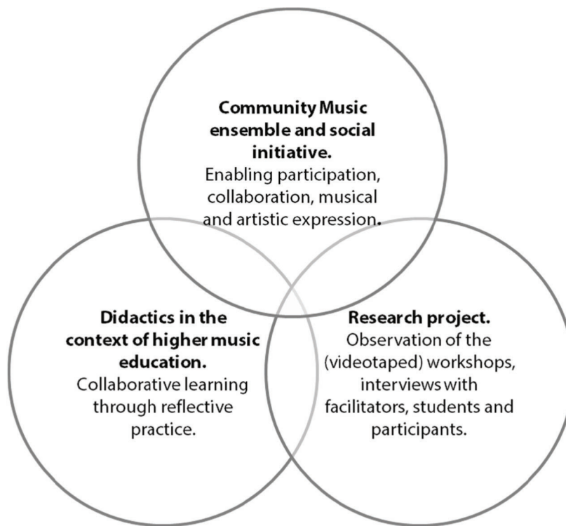
Figure 1: Dimensions of Meet4Music