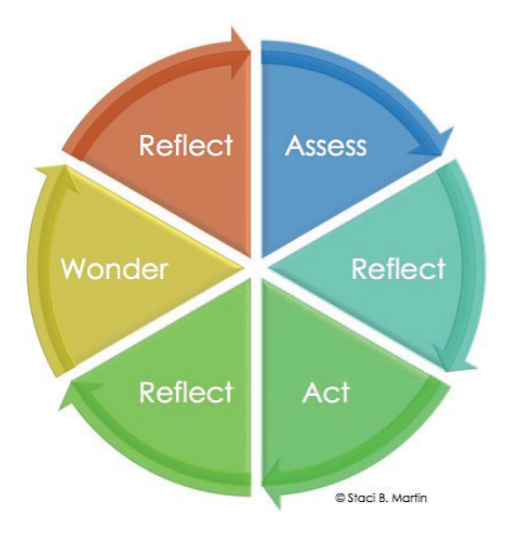
Figure 2. CBA process (Martin et al., 2018)

We used a research process that had three phases: assess, act and wonder (refer to Figure 2).