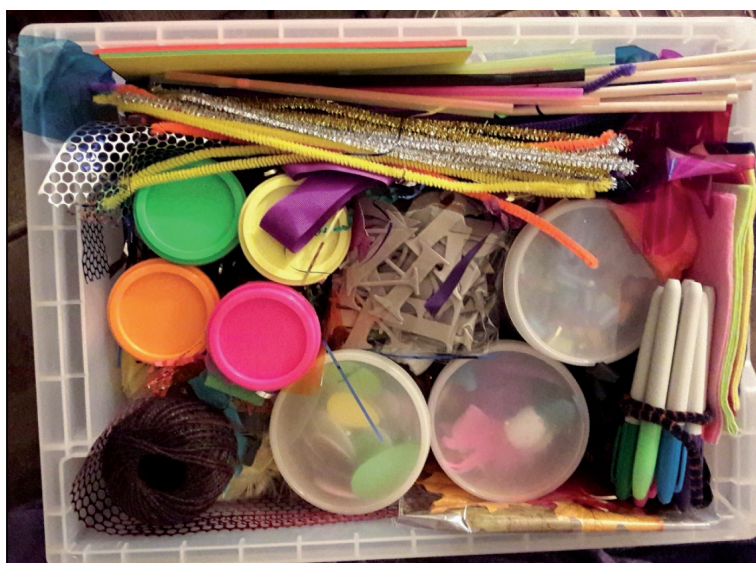
Figure 1: The collage box

Interviews opened with an opportunity to talk about when, why and how the participants became teachers, with the aim of establishing a trustful rapport. After that, and with prior notice by email, participants were asked to talk about 'a time when you knew you were struggling', an open question that allowed them to direct and control their narrative. When these accounts seemed to come to an end, I suggested setting up the collage-making activity. All had been informed in advance that this would be part of the first interview and I had reassured them that it was not about their artistic ability. All 14 participants created a collage using the materials I provided; some added various personal items from their home to their collages. For example, one participant used a body board as the underlay for his collage. Another participant wanted toothpicks, so got some from his kitchen.