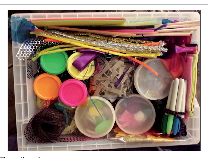
Figure 1: The collage box

Interviews opened with an opportunity to talk about when, why and how the participants became teachers, with the aim of establishing a trustful rapport. After that, and with prior notice by email, participants were asked to talk about 'a time when you knew you were struggling', an open question that allowed them to direct and control their narrative. When these accounts seemed to come to an end, I suggested setting up the collage-making activity. All had been informed in advance that this would be part of the first interview and I had reassured them that it was not about their artistic ability. All 14 participants created a collage using the materials I provided; some added various personal items from their home to their collages. For example, one participant used a body board as the underlay for his collage. Another participant wanted toothpicks, so got some from his kitchen.