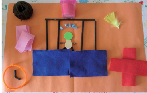
Figure 2: Examples of collage (left: Veronica; right: Kathryn)