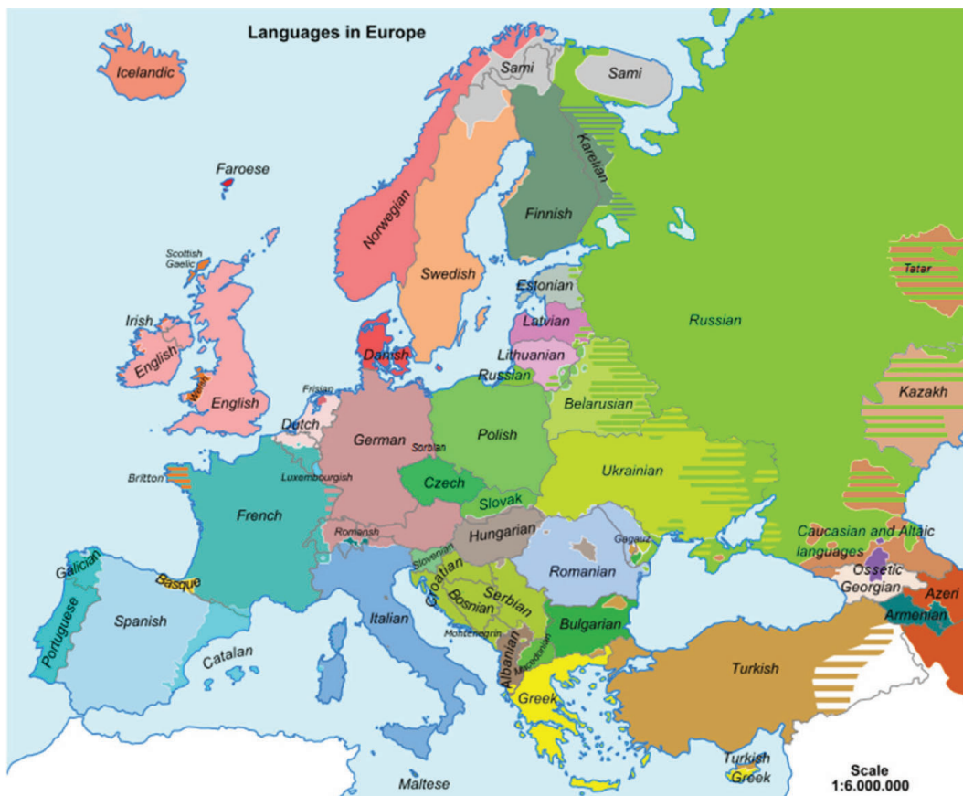
Figure 2: Map of languages in Europe