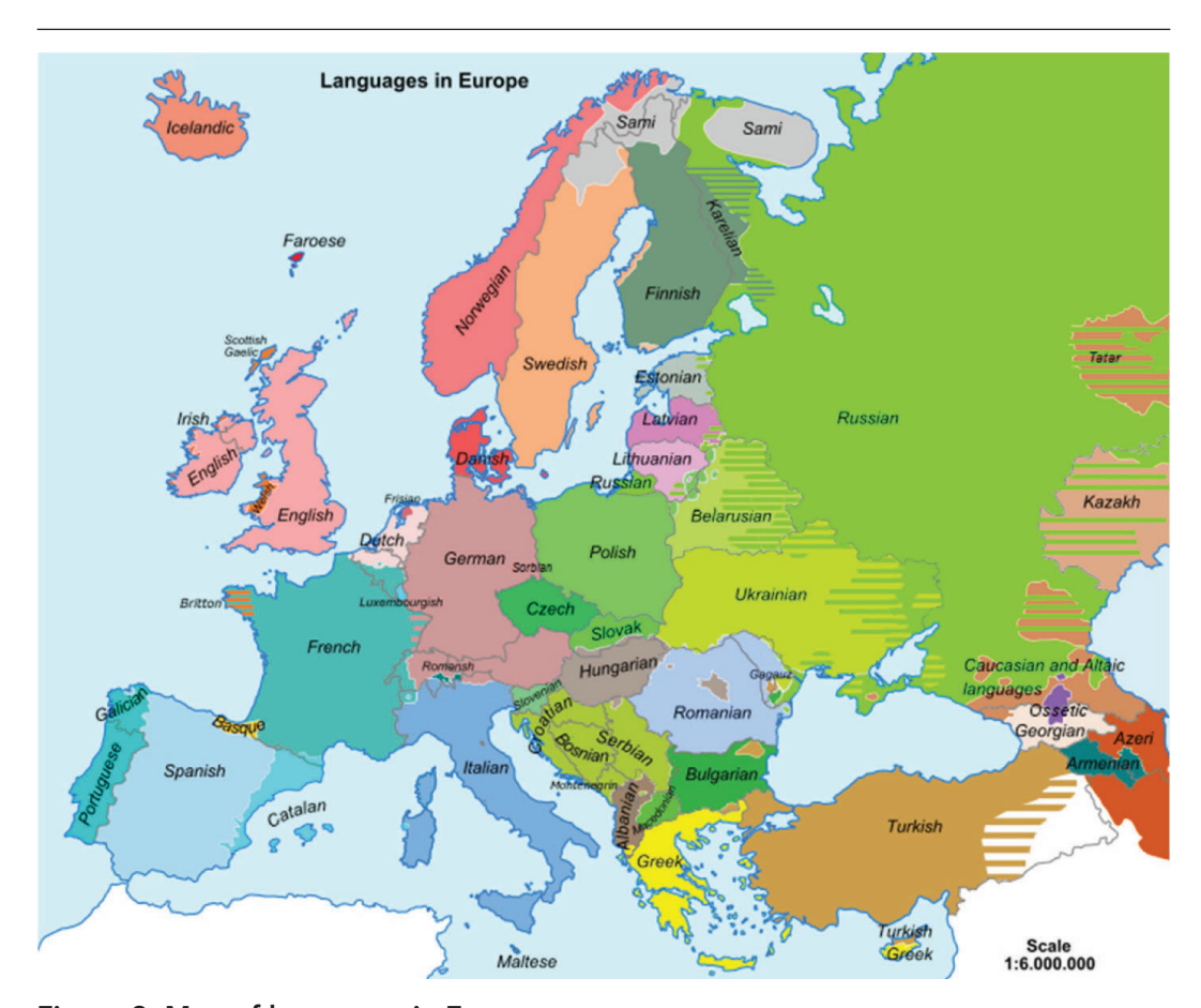
Figure 2: Map of languages in Europe