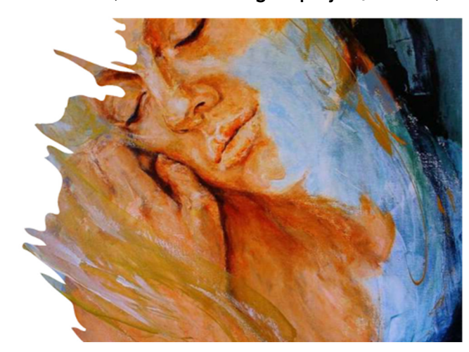
Figure 3. Being in touch with life (SIIL student's digital project, 2021/2)