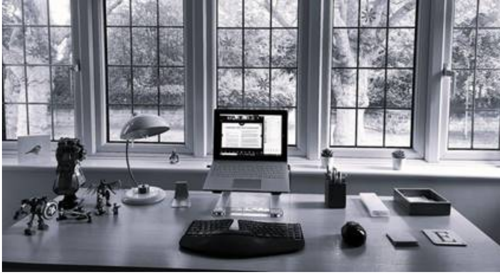
Figure 2. Enabling fictions: Su's composed working space

Figure 2 shows Su's working space during lockdown. There is no sense within it that this is a bedroom within a home. Su shared how, when the closure of the physical spaces of universities and schools shifted all learning and teaching activities online, the bedroom became his temporary office and virtual classroom for university teaching activities. In the new working space, countless hours were spent on virtual meetings, online teaching sessions and hosting/presenting and attending academic conferences. During the lockdown, Su too had to negotiate with family members to create a professional working space at home, while still catering for the necessary space to enable his two children's sudden move to home schooling. The kitchen table, a space usually for interactions as a family while preparing and sharing meals, became dedicated to their learning activities.