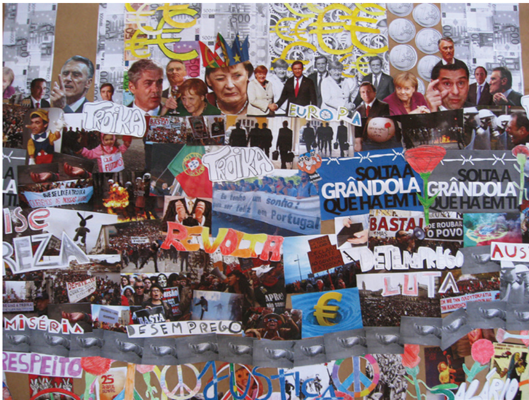
Figure 6: Money rules in Europe (whole class work, primary school, Portugal)

In contemporary European contexts, this sense of the other, and the appreciation of another's situation, are vital in promotion of genuine citizen understanding. As Eisner (2002) urges, we should be prepared to experiment with alternative ways to explore citizen conceptions of belonging. Students in our study responded visually as well as verbally to personal issues relating to culture, identity and citizenship, developing a 'creative community' between teachers and students across the partner countries, with a shared sense of openness, experimentation and risk taking. The collaborative work from a Portuguese primary school (see Figure 6) is influenced by the Irish artist Seán Hillen's depictions of dystopian landscapes in nameless cities. This montage (3 metres high and approximately 1.5 metres wide) explains their views of Portugal's political landscape – the 25 April Revolution, the present and future – the Euro crisis and social instability.