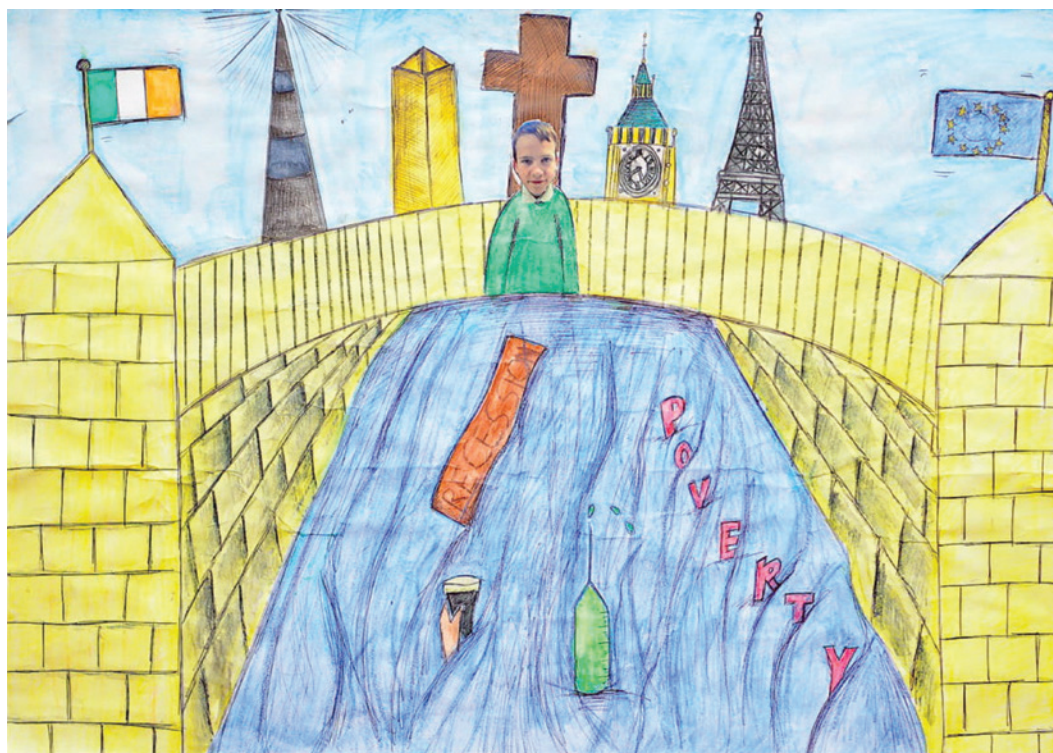
Figure 2: My view (Stuart, Ireland)

The students appreciated the highly charged political nature of European societies, and they were unafraid to explore perceived challenges to a sense of shared European citizenship and anxiety for the stability of their futures based on their current lives. Students practised ways of expressing themselves to explore cultural understanding and explain how they perceive themselves to be understood as individuals and as citizens. In all six countries there were popular themes: for example, the global economic crises, the recession that has significantly impacted countries in southern Europe since 2008, and fear of the events surrounding the recession were well articulated by entire classes in Portugal and Spain (see Figures 3 and 4), who boldly expressed anger and doubts about current political measures that directly affect their lives. Other children expressed their fears about individual issues, and these focused on personal and broad topics. As Figure 2 suggests, Stuart was fearful of poverty, drugs and the impact of the