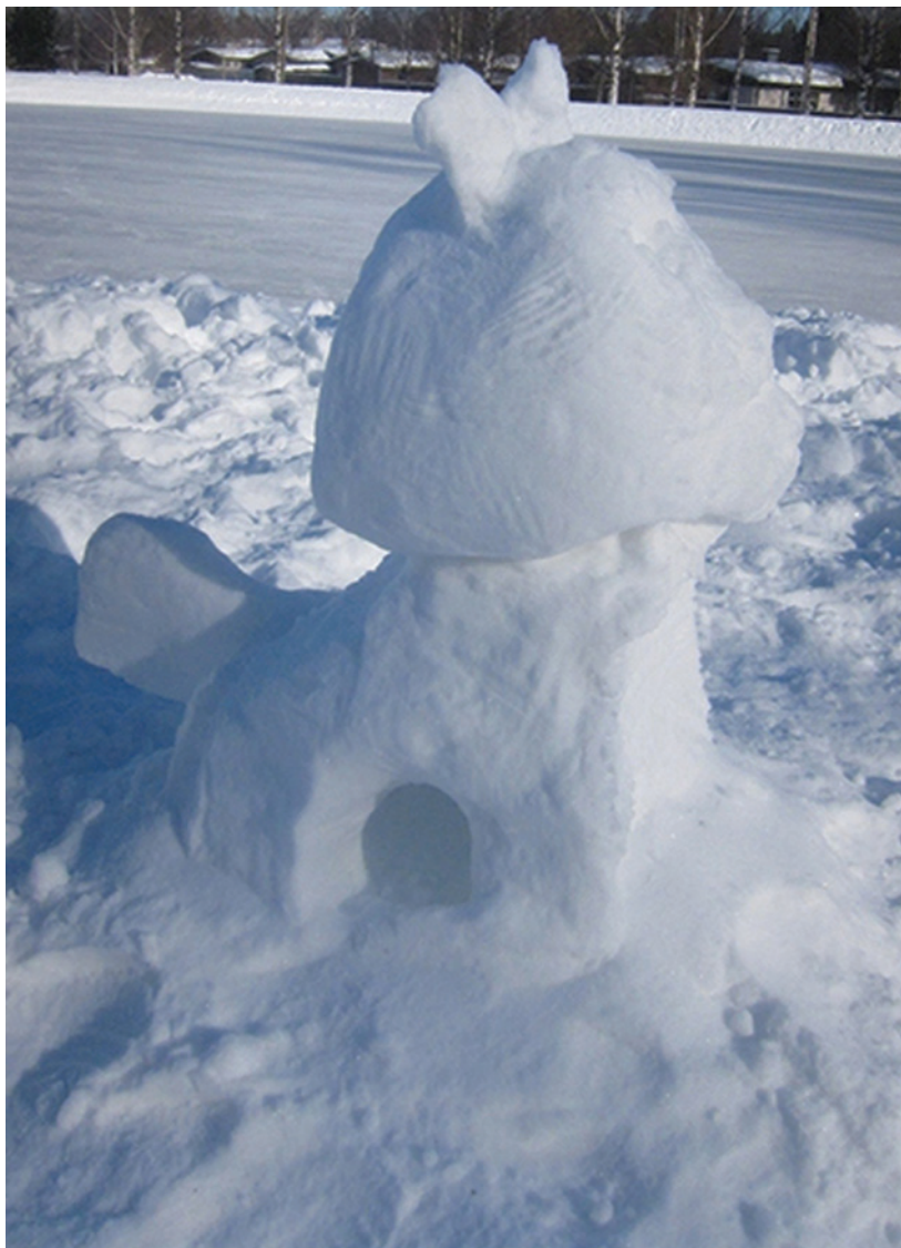
Figure 3: A little souvenir for our Portuguese friends (Jac, Olli and Ludwig, aged 8, Finland)

In the Finnish schools, Creative Connections used contemporary art as a valuable means of allowing students to think about and represent their everyday life – it has an innate transformative quality (Delanty, 2007; Mason and Buschkühle, 2013; Jokela et al. , 2015; Manninen and Hiltunen, 2017). Such transformations were also evident in the ways in which children worked outside of the classroom (as Figure 3 shows) and then shared online with peers.