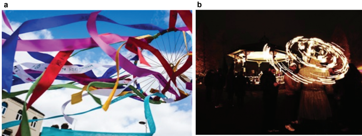
Figure 4. Artists' creative consultation tools (Source: intervention by Nicola Winstanley and Sarah Nadin; photographs by Jenny Harper, 2015). (a) Ribbon wheel; (b) Firegarden light umbrella

Reflecting on the Get Talking model outlined in Figure 1, creative techniques therefore became a significant element of the Appetite evaluation. However, the core principles underpinning PAR took differing levels of priority in light of the challenges, resulting in an adapted version of Get Talking better suited to the needs of a large-scale arts evaluation.