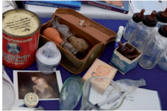
Figure 1: Close up on part of the Nain, Mam and Me stand