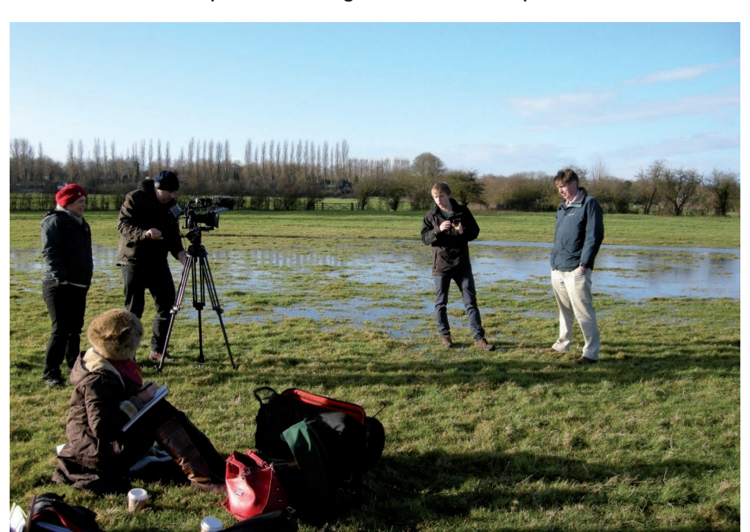
Figure 4: Filming expert opinion about the societal and economic impacts of research into carbon capture and storage in lakes and floodplain meadows