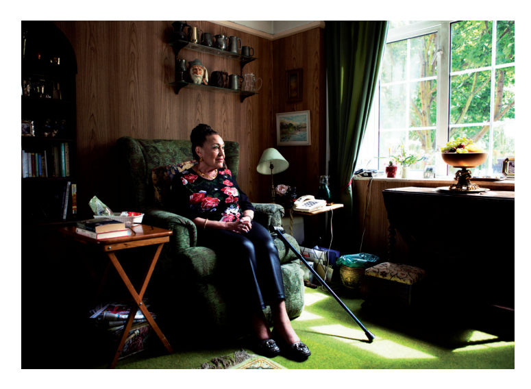
Figure 3: From the series 'The Journey'