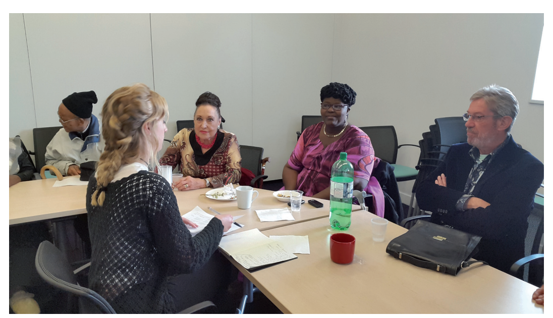
Figure 7: The student artists at a Stroke Research Patients and Family Group meeting

The student artists attended two SRPFG meetings before beginning the project. Their evident enthusiasm seemed to help 'warm up' the stroke survivors to the project and give it momentum (see Figure 7). The student artists commented that these early exchanges had helped them understand that there were other aspects of stroke, beyond preconceived ideas about medical treatments and disability, which could be portrayed through their artwork. In reaction to this, the stroke survivors suggested that the project's objective might be to provide an alternative representation of stroke from the usual images in the media (particularly signs of acute stroke, such as facial droop and weak limbs, often seen in campaigns to raise awareness of stroke).