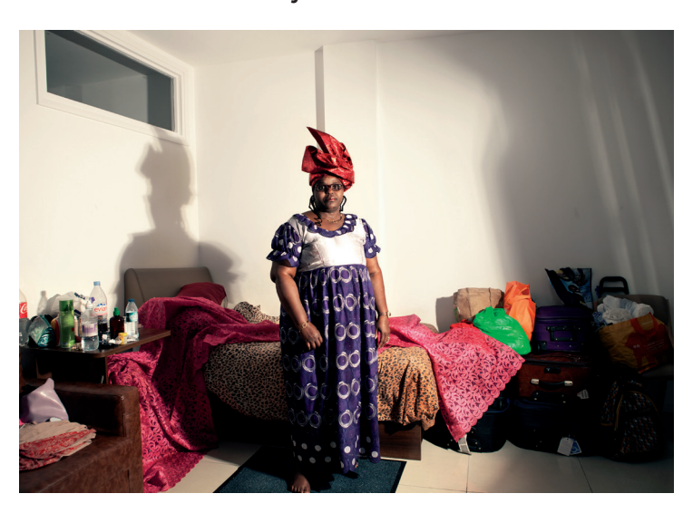
Figure 2: From the series 'The Journey'