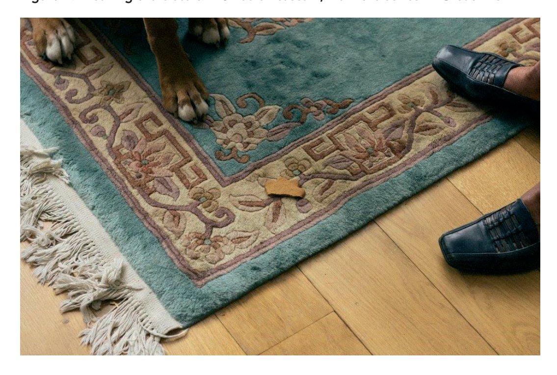
Figure 9: Breaking the biscuit: A Swedish custom; from the series 'A Great Wish'