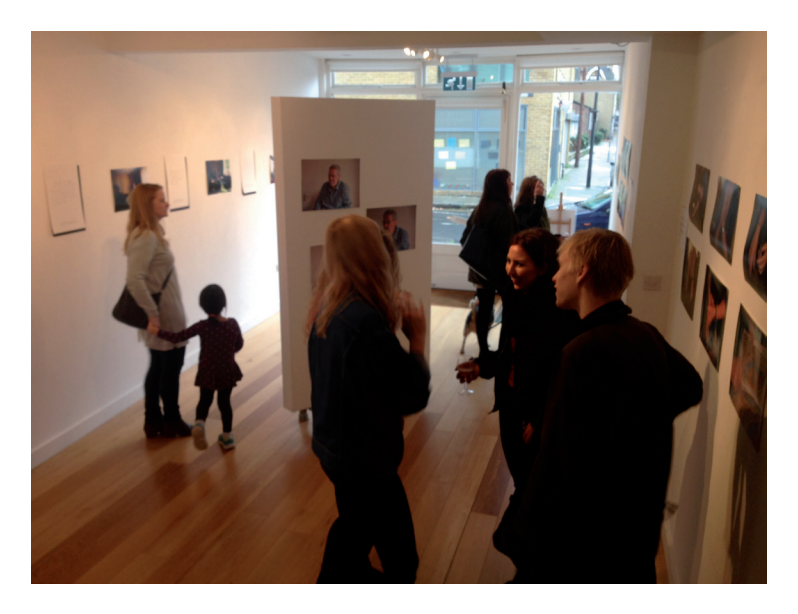
Figure 6: The exhibition open event at the Paul McPherson Gallery, Greenwich, November 2015