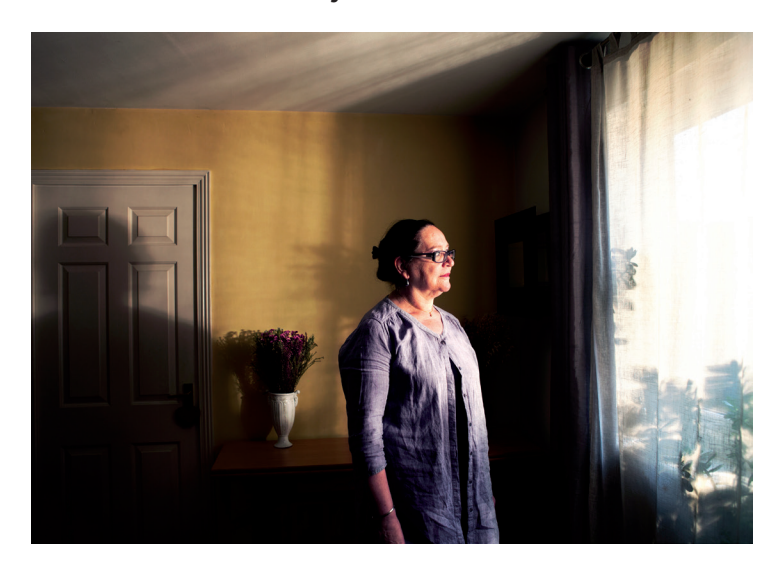
Figure 1: From the series 'The Journey'

The photographs were arranged into six series, accompanied by short descriptive texts written by the student artists. 'The Journey' is a series of five photographs of stroke survivors in their own homes (see Figures 1–3).