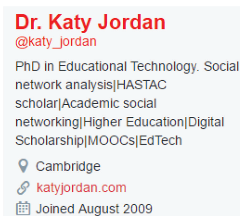
Figure 3: Example of Twitter profile

The project also demonstrates how Twitter can play a more significant role in the research cycle than just dissemination, highlighting the value of early network building in terms of being able to tap into otherwise unreachable sources of data (through crowdsourcing), building an audience, and engaging with that audience for critical reflection during the research process itself. Social media engagement needs to be built into the research process earlier in order to gain these benefits, as building relationships with network members is a two-way process and requires reciprocity.