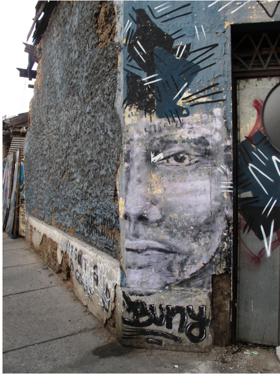
Figure 11 Valparaiso, Chile. Artist unknown.