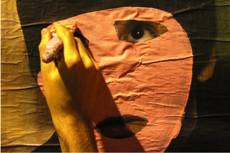
Figure 1 Buenos Aires, Argentina. Artist RRAA.-. The artist paints over a face on an advertisement leaving only the eyes and mouth exposed. Since 2012 he has been modifying the ever-growing amount of billboards in Buenos Aires to critique the commercialization of public spaces.