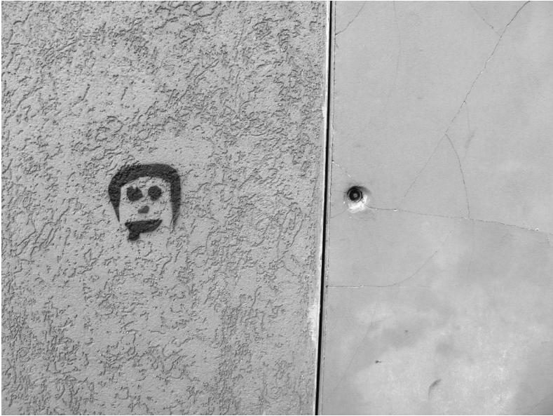
Figure 9 Buenos Aires, Argentina. Artist unknown. An anonymous mark left on the wall of the city serves to assert the artist's own existence in the metropolis.