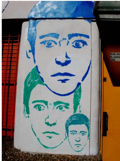
Figure 8 Buenos Aires, Argentina. Artist unknown. This stencil work conveys a profoundly personal sentiment; the young man's face portrays a variety of emotions ranging from panic to ambiguous uncertainty, familiar feelings for the modern city-dweller wrapped up in the chaos and overstimulation that the metropolis evokes.