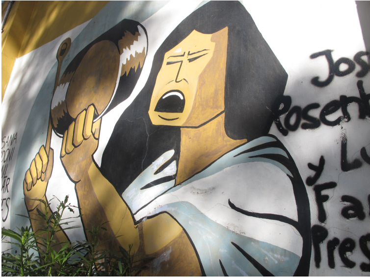
Figure 5 Buenos Aires, Argentina. Artist unknown. When economic crisis struck Argentina in 2001 many communities in Buenos Aires banded together into asambleas populares , public gatherings providing a space for both social support and political protest. This mural commemorates the asamblea popular of the Chacarita neighbourhood and the empty-pot protests that characterized this period of unrest and uncertainty.