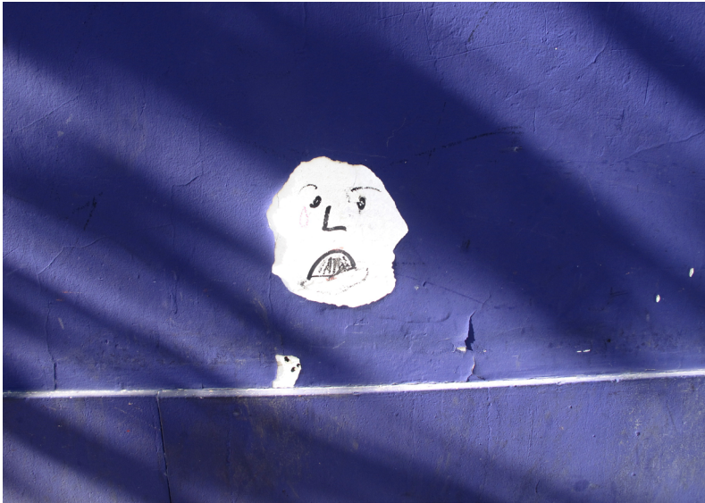
Figure 2 Buenos Aires, Argentina. Artist unknown. An individual intervention in urban space need not have the scale or intricacy of a Banksy or a Blu. This grimace scribbled onto a flaking façade typifies the wit and dynamism that graffiti brings to the city – in exuberant contrast to the controlled sterility of neoliberal urbanism.