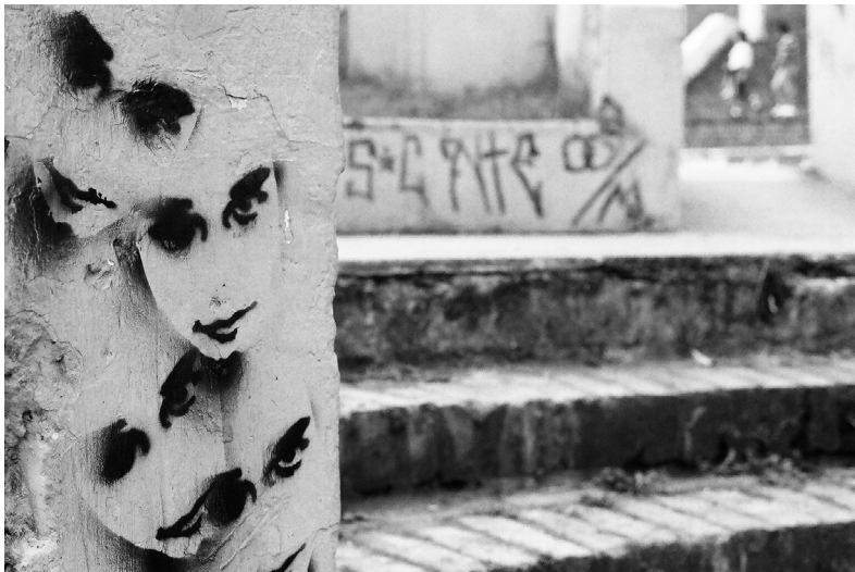
Figure 12 Bogota, Colombia. Artist unknown.