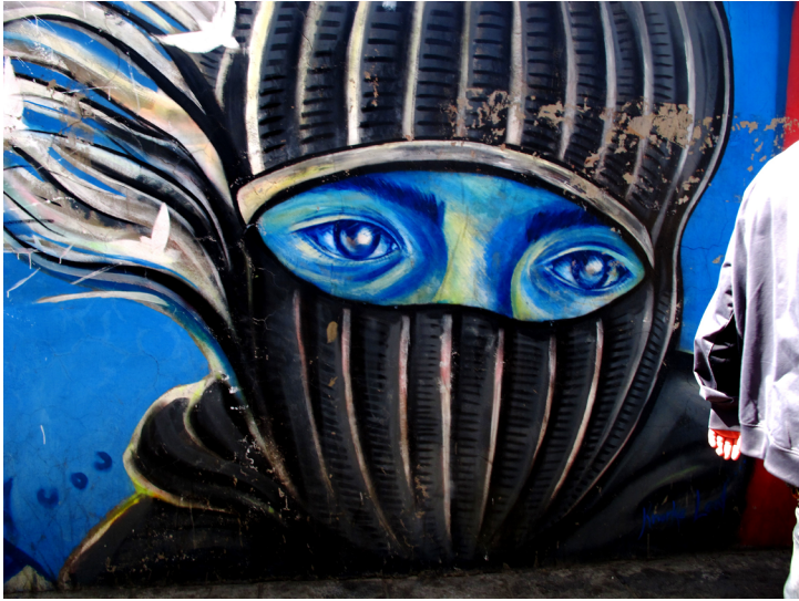
Figure 3 La Paz, Bolivia. Artist unknown. Shoeshiners are a familiar sight in the public spaces of the Bolivian capital, yet these workers cover their faces as the job is seen as shameful. This portrait, with its dignified gaze through iridescent eyes, makes the shoeshiner appear as an anonymous guardian of the city – a masked superhero of quotidian urbanity.