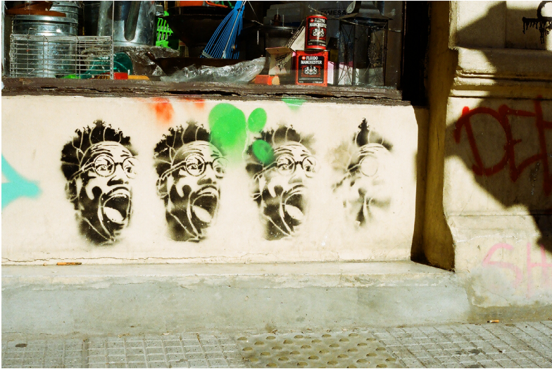
Figure 7 Buenos Aires, Argentina. Artist unknown. Stencil of Giancarlo Esposito as Buggin' Out in Spike Lee's Do the Right Thing . Like much of Lee's work, Do the Right Thing deals with changing community dynamics, racial tensions and gentrification – issues that permeate many neighbourhoods in Buenos Aires today.