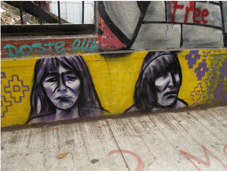
Figure 10 Valparaiso, Chile. Artist unknown. Indigenous faces adorn the walls in Valparaiso, raising the public profile of an increasingly marginalized community. Image also reproduced on front cover.