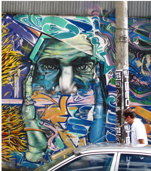
Figure 4 Bogotá, Colombia. Artist unknown. Artists in the La Candelaria neighbourhood often depict local characters on their walls, elevating ordinary people to a level in parallel with politicians and military figures who are made present in the city with statues and public portraits.