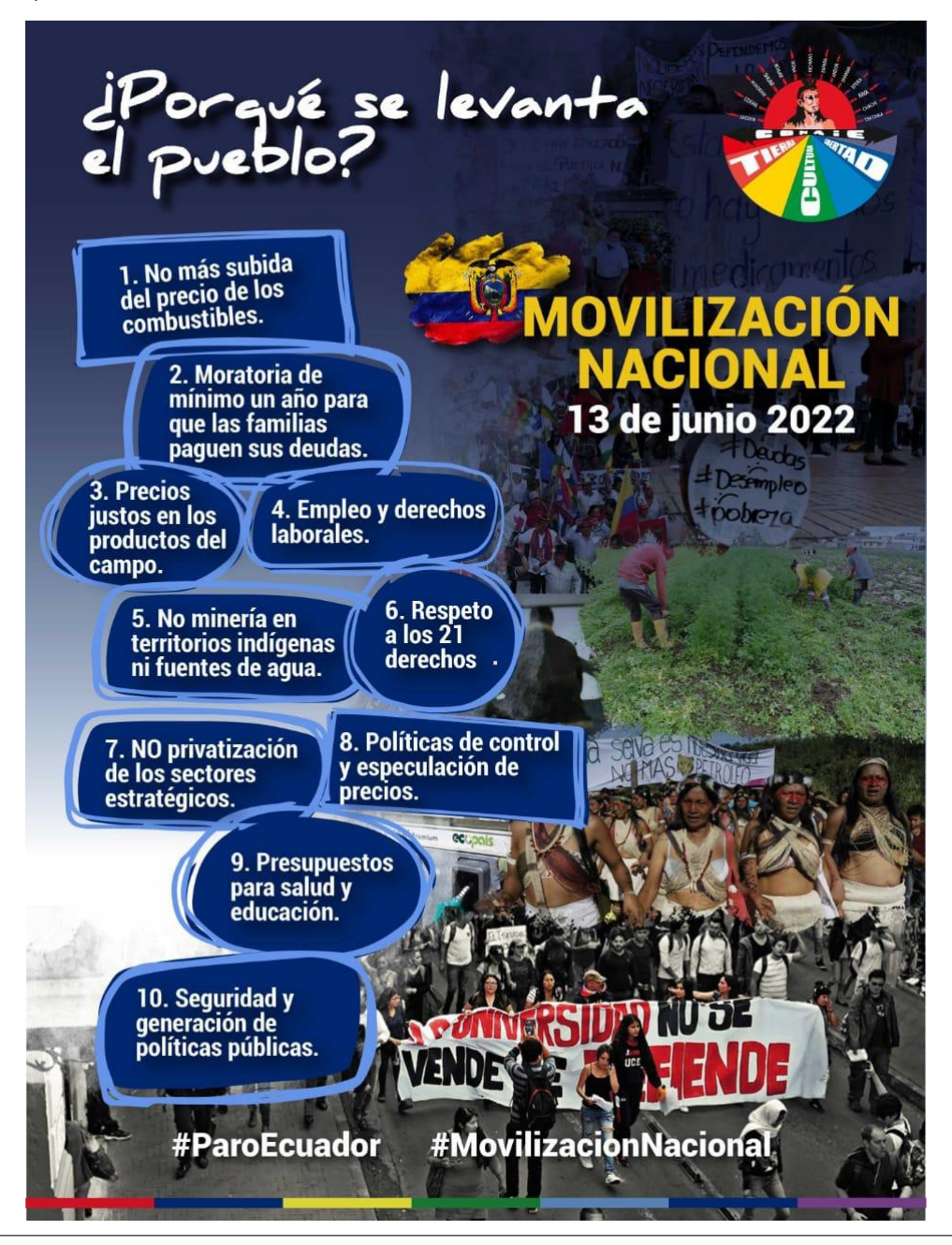
Figure 3. CONAIE protest demands, June 2022

Noboa will serve as president until 2025, when new elections will take place for a full four-year presidential term. His decision to implement a state of emergency, militarise the country and declare war against drug