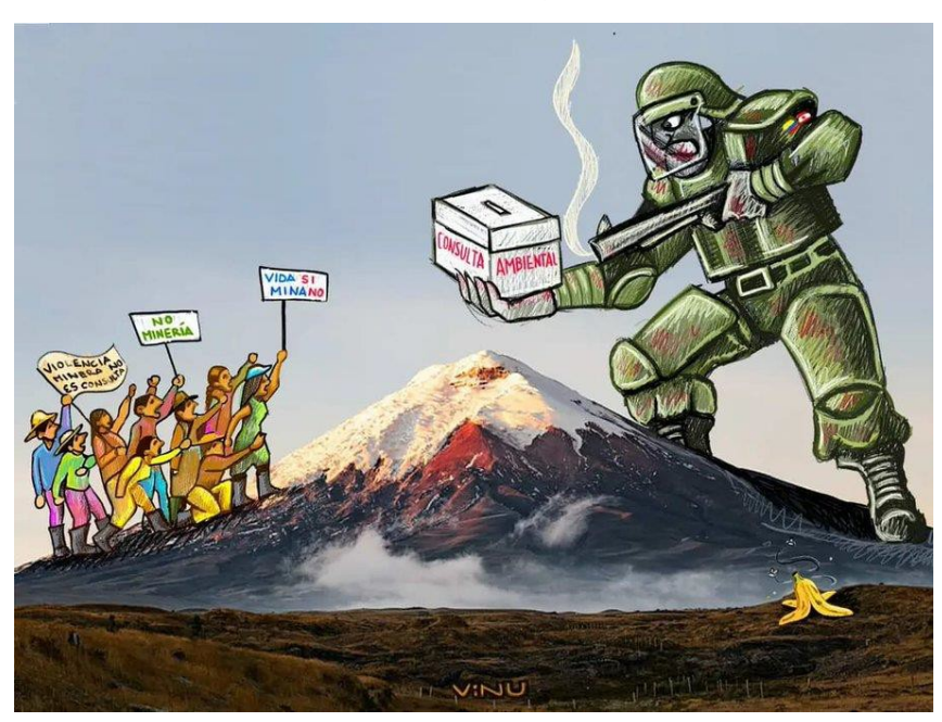
Figure 5. Militarisation of mining in Cotopaxi, March 2024