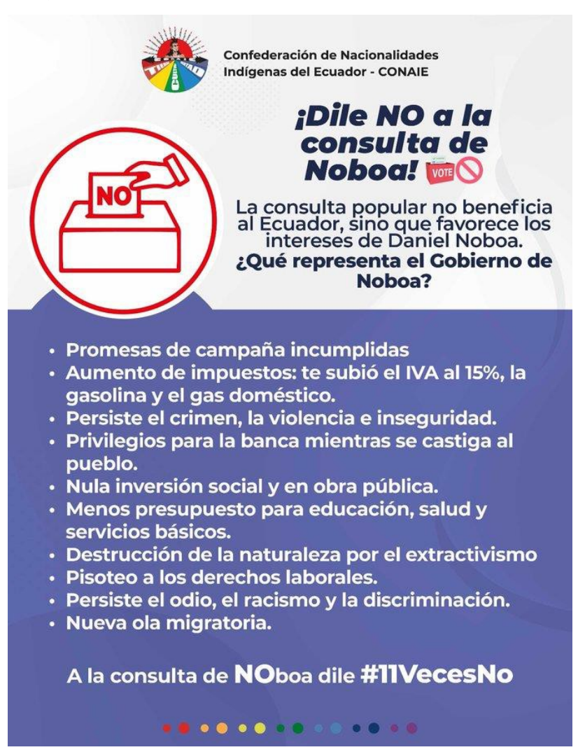
Figure 6. CONAIE anti-referendum campaign, April 2024

A major challenge for a truly national plurinational project is overcoming the geographic and social reach of the Indigenous movement to incorporate mestizo and afroecuatoriano communities, organisations and movements, especially in the populous coastal region. The conditions of peripheral capitalism make 'capitalist realism' - that is, the inability to imagine life beyond capitalism - less entrenched, and the diverse customs, practices and cosmologies that coexist in Ecuador create fertile terrain for a progressive national plurinational project. 124 However, weaving all this together into a national movement means overcoming significant obstacles, including long-standing regional divisions. The environmental consciousness that has strengthened in recent decades can support efforts to move in this direction, especially if it can be linked to progressive thinking about labour, food and production. Amid darkness, light shines.